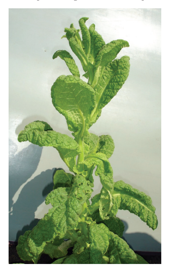
Fig. 1: Tobacco plant infected with Leaf Curl

The leaf curl disease in tobacco has been found to be caused by various begomoviruses. In order to confirm the disease symptoms at molecular level, leaf curl virus specific genomic sequences especially Coat Protein (CP) region was targeted for PCR amplification. The CP specific primers were designed using the conserved regions of 725bp from tobacco leaf curl virus-Karnataka1 (TbLCV-Kar1) and tobacco leaf curl virus-Karnataka2 (TbLCV-Kar2) genes available in the NCBI data base. The PCR amplification with CP specific primers in the infected samples resulted in the amplification of around 725 bp fragment in the isolates (Fig.2). The amplified fragment of the partial coat protein region confirms the presence