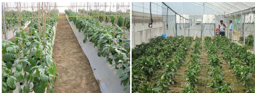
Fig. 2 Crop cultivation inside the protected structures

Protected cultivation holds the key in the future for the production of high value crops under organic methods especially for efficient use of land and water. Protected structures (Fig. 2) such as green houses, poly houses, poly tunnels and net houses which protects the crop from high intensity of light, high rainfall, winds, insects through structure, polyethylene film/ polycarbonate sheet, shading nets/ thermal nets, insect net, cooling pad, exhaust fan, foggers and drip systems etc. which controls light, temperature, humidity and irrigation and other required growth substances directly into the root zone of the plant. Water and nutrients enter the soil from the emitters, moving into the root zone of the plants through the combined forces of gravity and capillary. In this way,