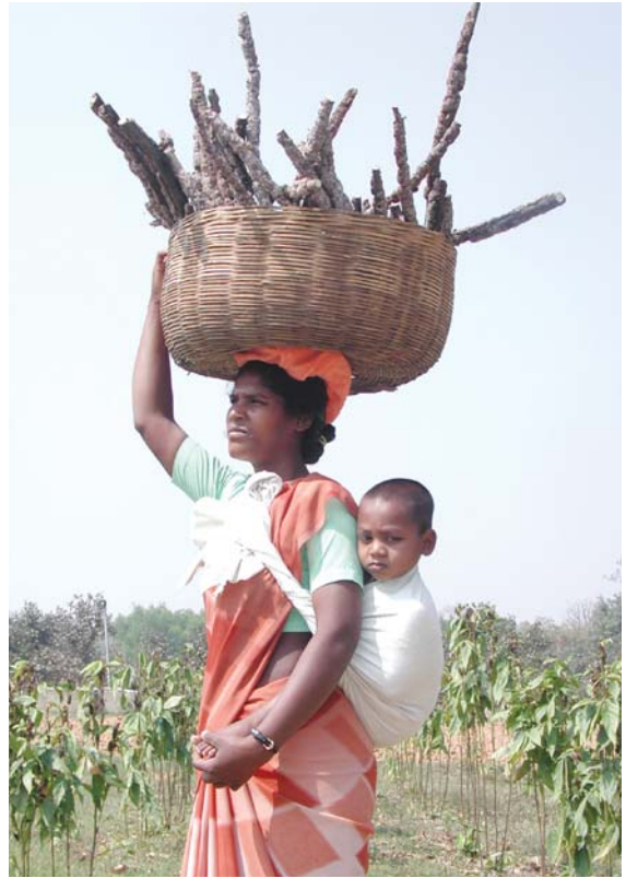
Tribal lady carrying harvested lac

important source of subsidiary income to farmers in around 70 disadvantaged districts. But, it is envisaged that the economic, educational and social picture of such farmers would undergo a vast improvement in the forthcoming years. Looking forward, the income pattern of various sections of Indian population would have undergone sea change by the middle of present century. Therefore, sustenance of interest in production systems of NRGs would necessitate proper tuning of production economics coupled with appropriate operation scales.