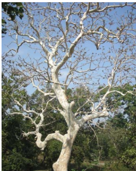
Karaya gum tree

There is need for achieving desired awareness among all stakeholders about the economic benefits of production to the growers/collectors, industrial potential of the materials to the processors and advantages of using NRGs to consumers. The policy makers at the State and Central levels need to be sensitised from time to time about the sector for required policy and developmental support.