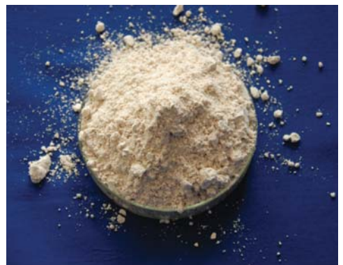
Tamarind gum powder

The following applications are suggestive of emerging areas to provide some insights rather than a comprehensive picture of new areas for NRGs in the forthcoming decades.