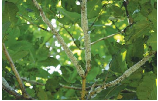
Lac crop on its host kusum

of production systems. We have to work towards production technology transition with a negative relationship between the manpower involved, over the period. The production systems would have to be made highly efficient for resource utilisation and pest management need to be highly environment-friendly.