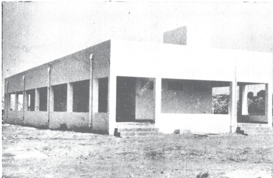
New Nursery Building