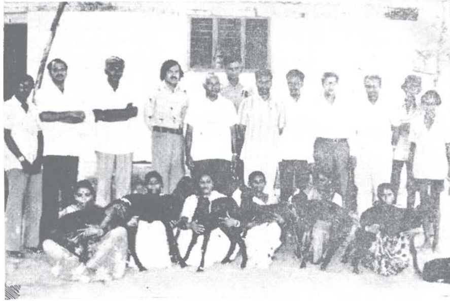
At Jeddangi, goats were distributed to Agricultural women labourers under Lab to Land Programme