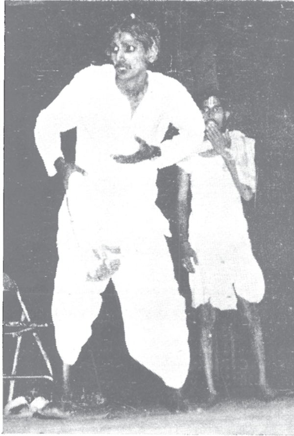
A scene from the play-let 'Tamasoma Jyotirgamaya' presented by the members on Club annual day on 9-5-81.

The members of the Club presented two play-lets, 'Tamasoma Jyotirgamaya' and 'Dongagarostunnaru swagatam cheppandi' which were well enjoyed.