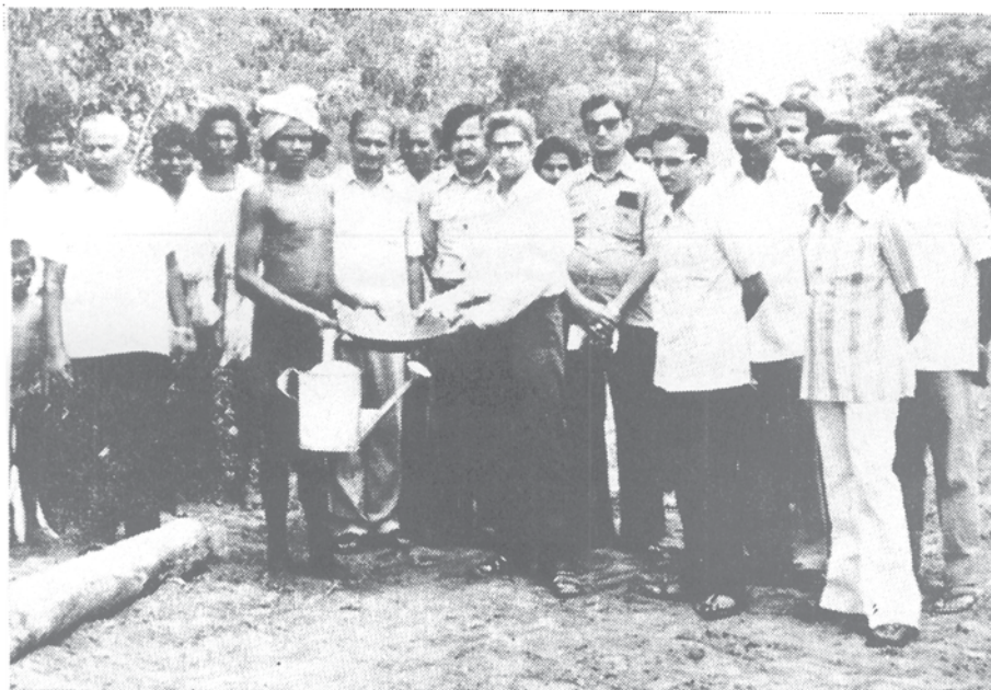
Rose cans and gammelas were distributed to the tribal agricultural labourers by the Director, Tobacco Research, at Kindra colony under the Lab to Land Programme.