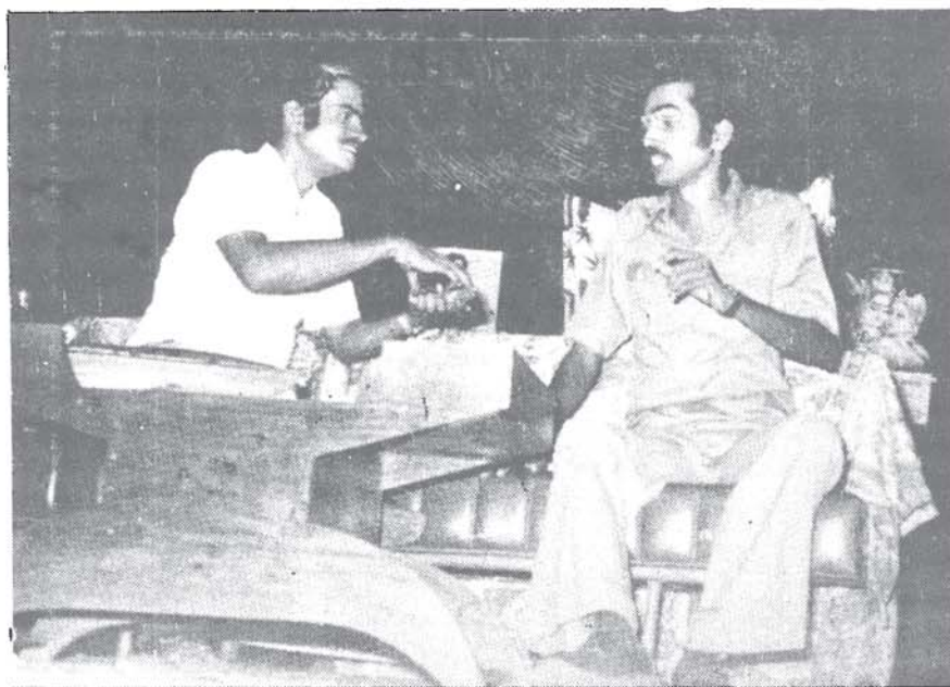
Scene from the play-let 'Dongagarostunnaru swagam cheppandi'