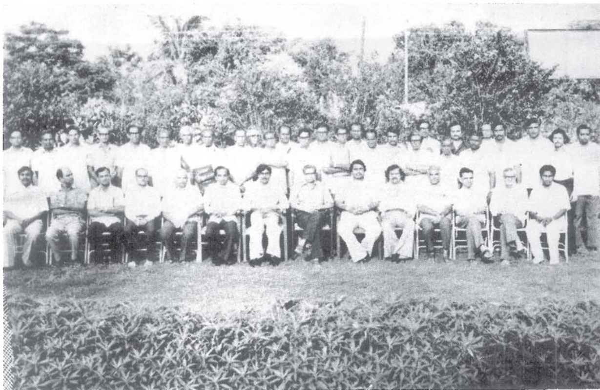
Photograph taken after the completion of the Inservice training programme organised for the technicians of the Institute and Research Stations from 4-8-81 to 7-8-81. The Director, Scientists of the Institute and A. O. and Officials of NAARM who imparted the training are seated in the chairs.

4-8 81 to 7-8-81: Inservice training programme for the technicians working at the Institute and Regional Research stations for a period of 4 days was conducted. Thirty technicians were selected for the training programme but 28 only have attended. Lectures on all aspects of tobacco production, personnel management, administration etc., were given to them by the Scientists, Administrative Officer, of the Institute and officials from NAARM, Hyderabad.