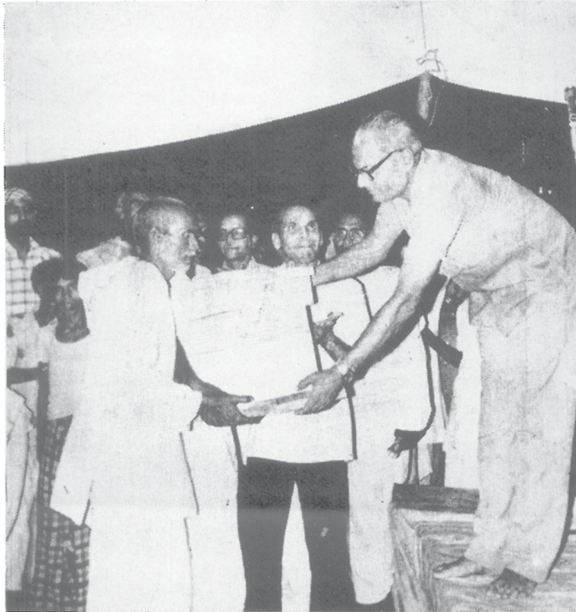
Bee keeping appliances were distributed to small and marginal farmers under Lab to Land Programme on a field day organised by CTRI Research Station, Pusa on 4-8-81.