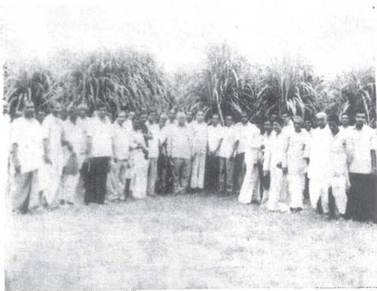
Farmers, trainees and extension workers appreciated the standing bulk crop of sugarcane taken with chewing tobacco at a demonstration on the Farm of CTRI Research Station, Pusa.