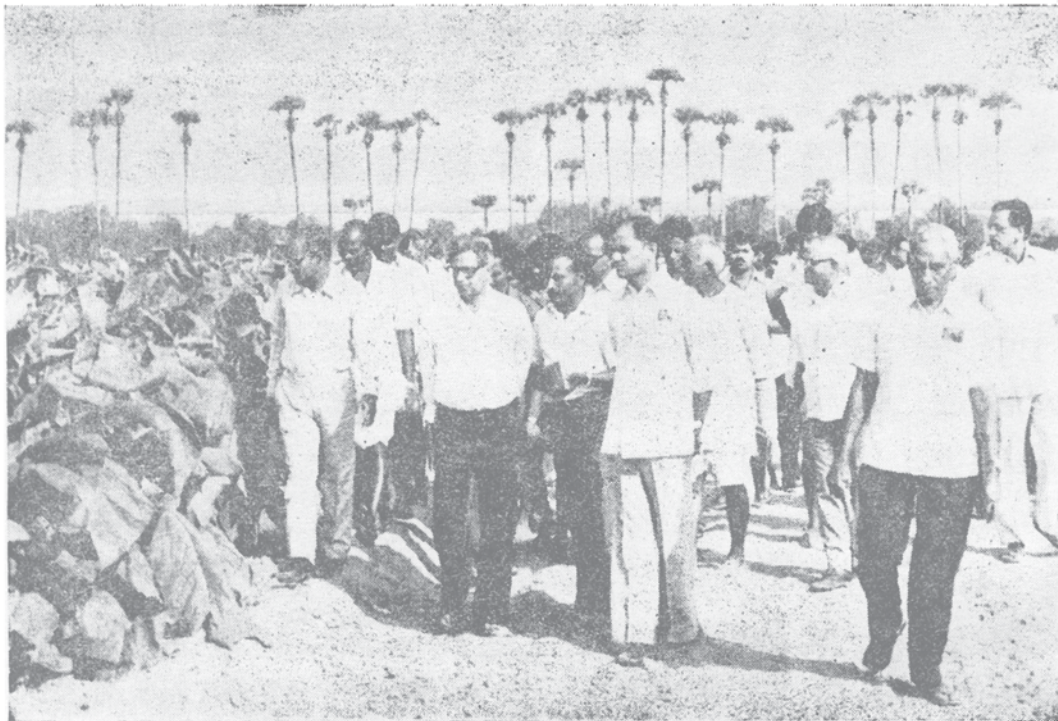
Field visits on the Farmer's day celebration at Kalavacharla