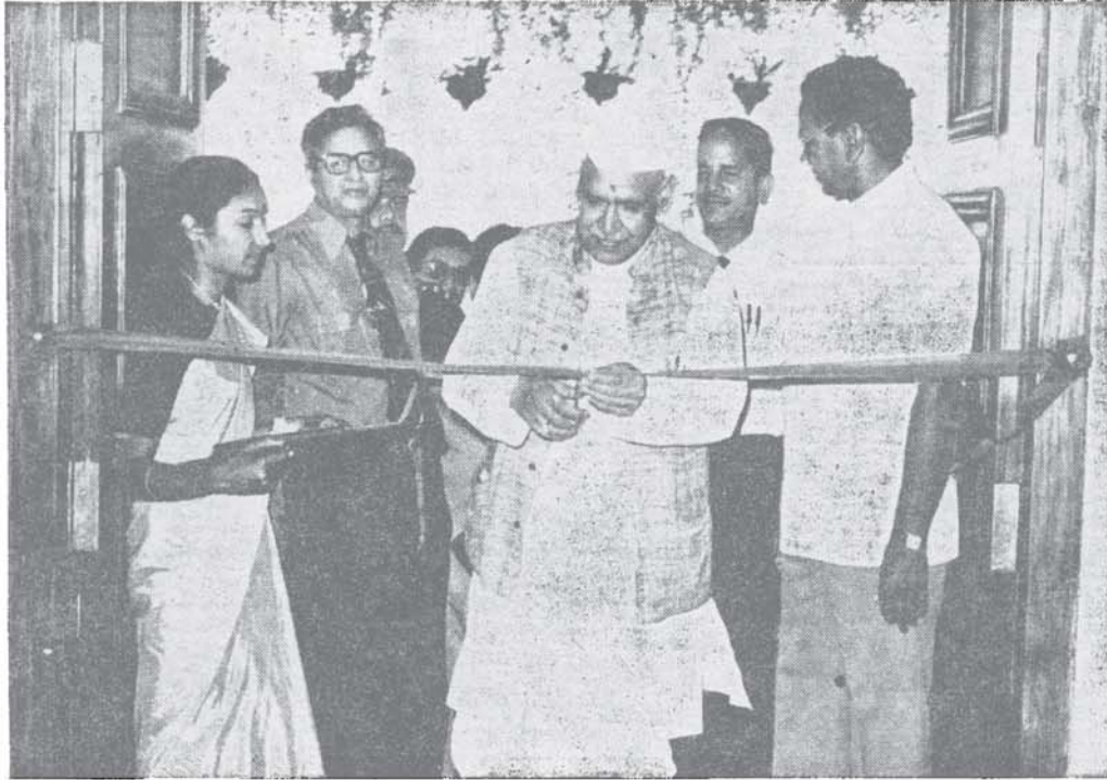
Governor inaugurating KVK information centre

parts of the state for a period of 3 weeks during January-March 1985 in curing and grading.