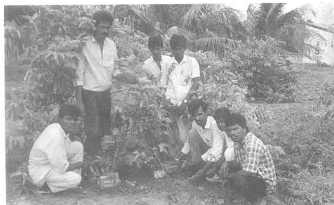
Training of rural youth in grafting techniques