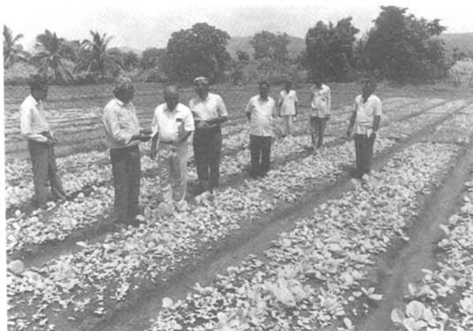
Quinquennial Review Team visiting the burley nurseries

The QRT visited White Burley Tobacco Research Centre, Jeddangi on 15-7-1993.