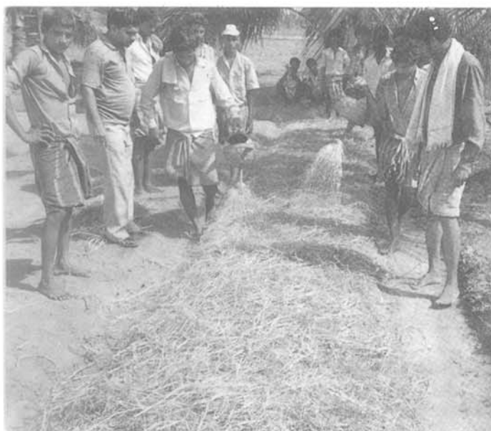
White Burley Nursery Management