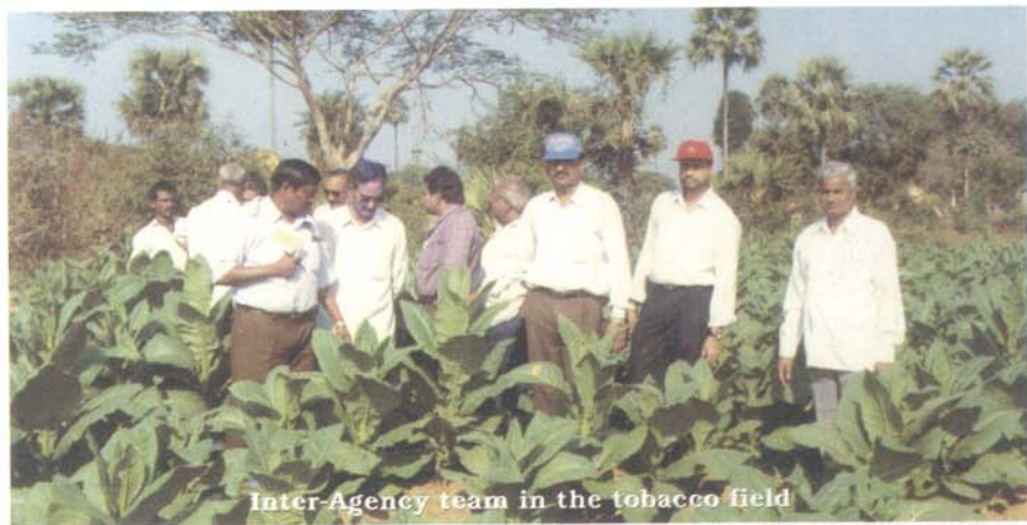
Inter-Agency team in the tobacco field

Suitable control measures were suggested to the tobacco growers for the above mentioned diseases and pests.