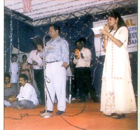
Staff children and Staff participation in cultural events