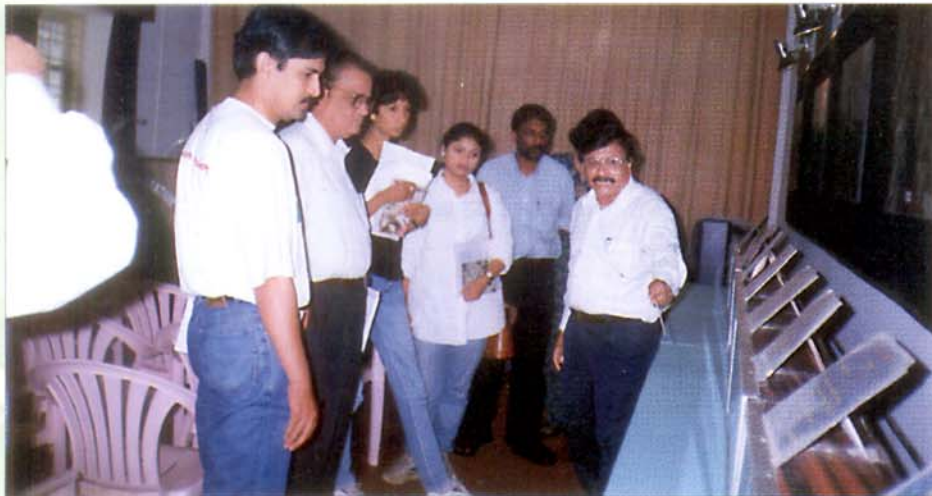
Journalists from The Times of India, The Deccan Herald, The Hindu etc. visiting CTRI RS, Hunsur on 17.10.2000