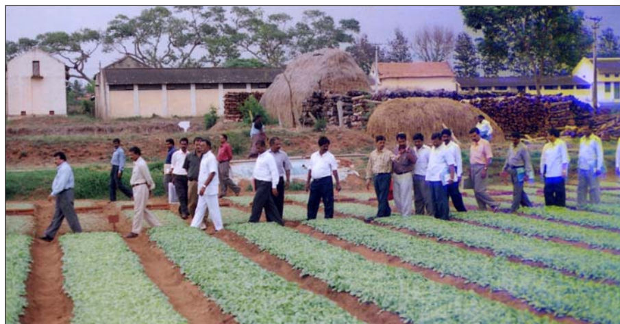
Tobacco Board officials at CTRI RS, Hunsur nursery