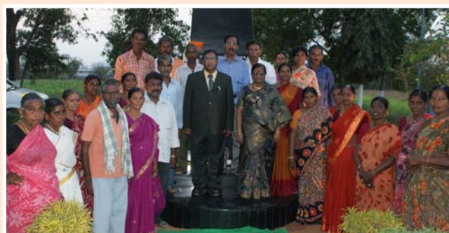
Director with the Staff of CTRI RS, Guntur