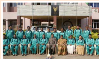
CTRI Sports contingent with Director

A twenty two member sports contingent from CTRI participated in the ICAR Inter-Institutional Sports Meet (South Zone) organized by IIHR, Bangalore during 7-11 Feb., 2011. CTRI won first prize in Volley Ball (Shooting), second prize in Volley Ball (Volley), second prize in High Jump (Women) and third prize in Discuss throw (Men).