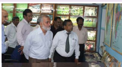
DG visits Tobacco Museum in CTRI