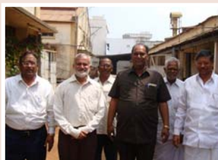
DG interacting with the Oil Mill owner at Kavali