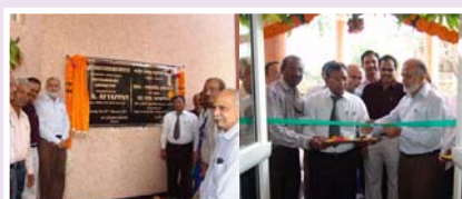
Inauguration of phytochemicals laboratory

The DG, ICAR visited CTRI, Rajahmundry on 19.02.2011 and inaugurated the Phytochemicals Laboratory and Fly-over tunnel at CTRI Farm, Katheru. He visited field experiments being executed at the Farm and visited CTRI Laboratories and museum. He had discussions with the scientists and staff during the visit.