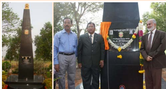
Inauguration of Platinum Jubilee Pylon