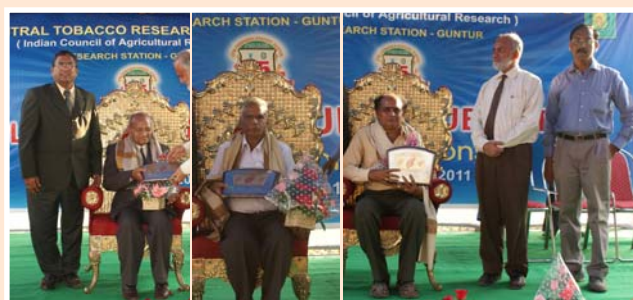
DG Felicitating the former Heads of the Research Station, Guntur