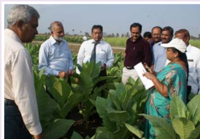
DG visits CTRI Farm, Katheru