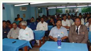
Cultural Programme in progress