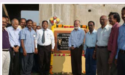
Inauguration of fly-over tunnel at Katheru