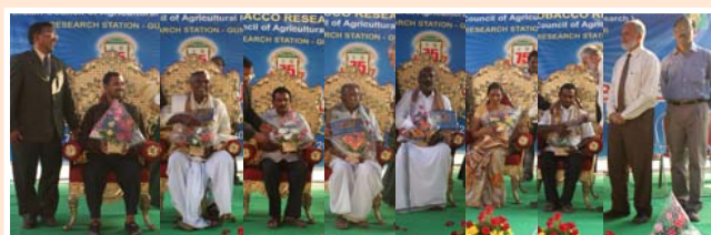
DG Felicitating the tobacco farmers