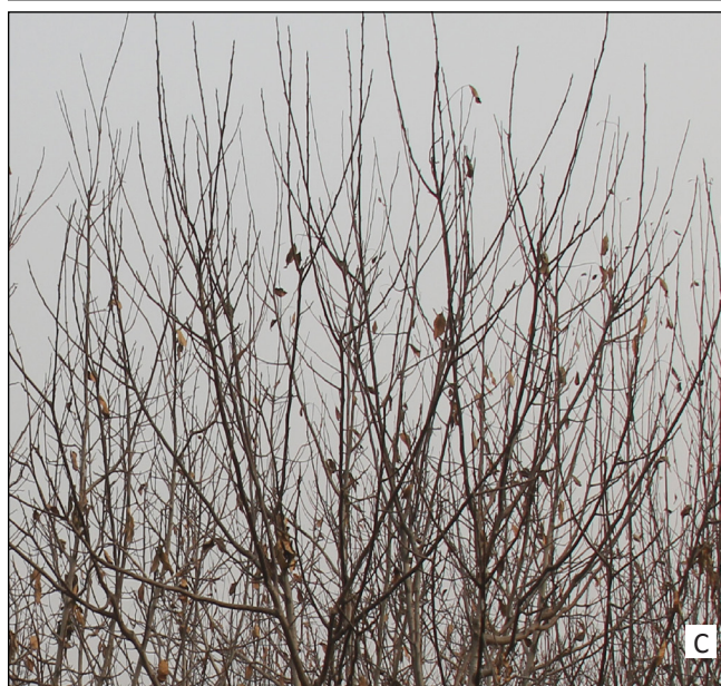
Figure 1: A: Morphology of fruit bearing branch of CITH-W-121; B and C: Showing difference in branching density and annual extension growth of dominant axis's in lateral (CITH-W-121) and terminal bearer (Sulaiman),