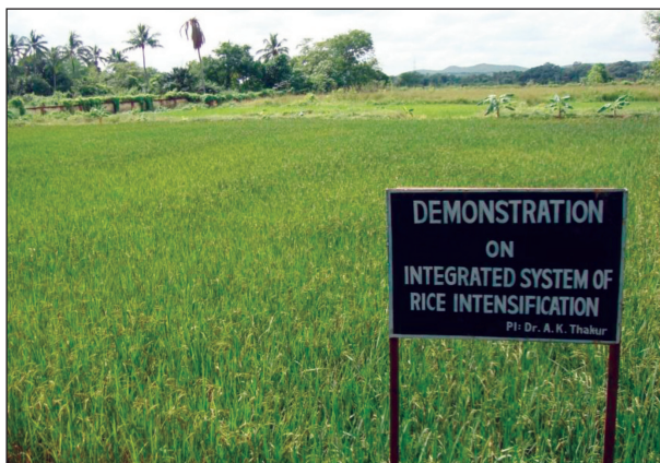
Demonstration field of ISRI

With integrated SRI methods (S-CW), excess water was saved in a small refuge and used for need-based