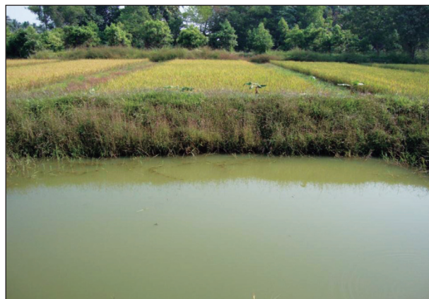
Integrated SRI field with refuge

Adopting any water-saving methodology of rice production or irrigation method recommended for SRI methods (keeping fields unflooded) during the wet or rainy season is quite difficult in the field as a substantial amount of rainfall occurs over a few months, and at times there can be either heavy rainfall or long dry spells occurring in most of the Asian countries. Under these situations, a rice crop faces the problems of having too much water, which inundate paddies and suffocate roots, and/or prolonged or intense dry spells that stress the rice plants. Either or both ultimately result into poor crop productivity. These stresses become more hazardous if the rice plants affected have not developed deep and healthy root systems.