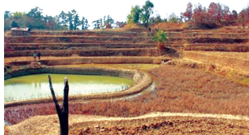
Fig 1 Zabo system of farming.

weightage of 5,4,3,2, and 1, respectively. An Exploratory Factor Analysis (EFA) was conducted in order to determine the dimensionality of the statements. Later, Confirmatory Factor Analysis (CFA) was performed using LISERAL version 8 software to validate the measurement model by assessing the unidimensionality, validity and reliability of the latent constructs derived from EFA. A hypothesized model was developed using the factors obtained through EFA and CFA to analyze the path for collective action behavior. Structural equation modelling was used for testing the model fit using the indices of model fitness, model comparison (CFI, IFI and NFI) and model Parsimony fit, besides testing of the hypotheses.