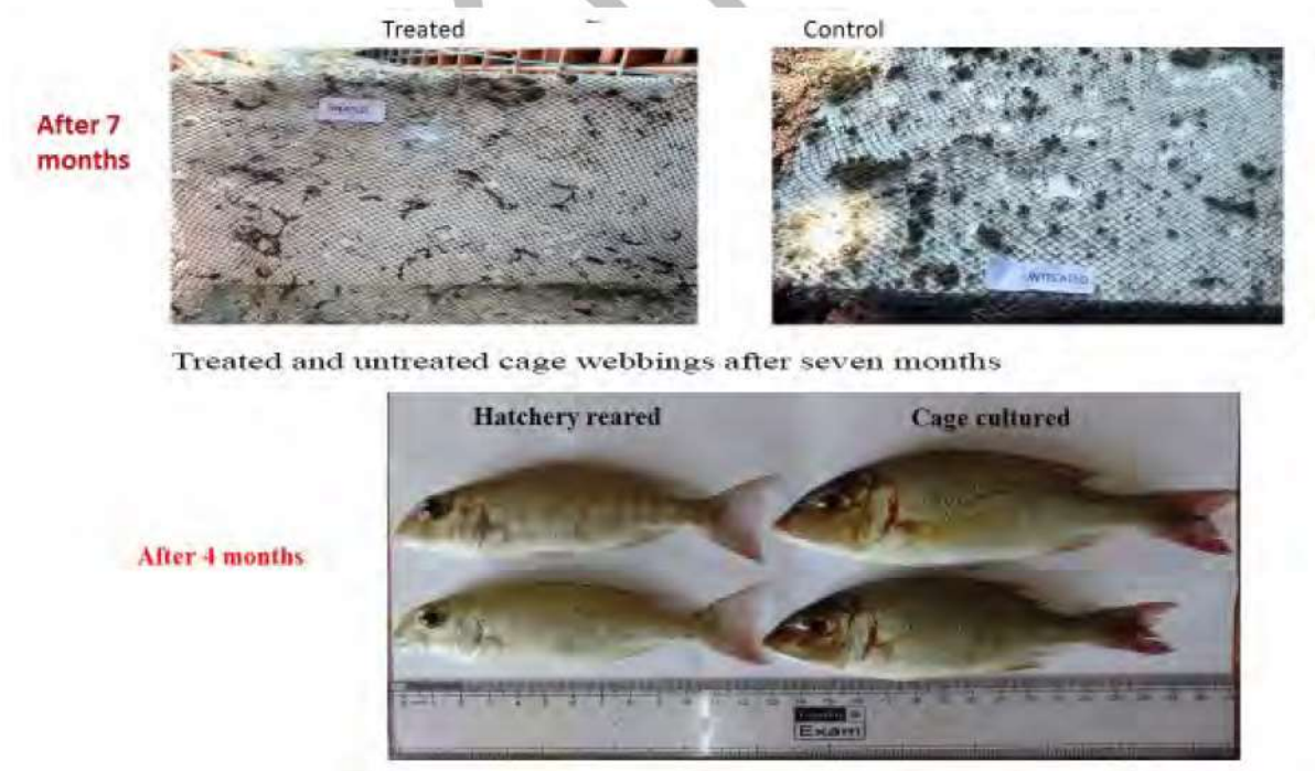
Fig 1. Control and treated net after 7 months exposure in the marine environments.

To study the biofouling resistance of the treated net can be evaluated by different methods. The field evaluation of the cage net showed the excellent biofouling resistance after 90 days exposure in the estuarine environment. The experiment was repeated by constructing a cage with treated and control panels and exposed in the Vizhinjam coast for 7 months (fig 1). The fishes grown in the cages and controlled environments were compared and exhibited significant difference in growth was shown.