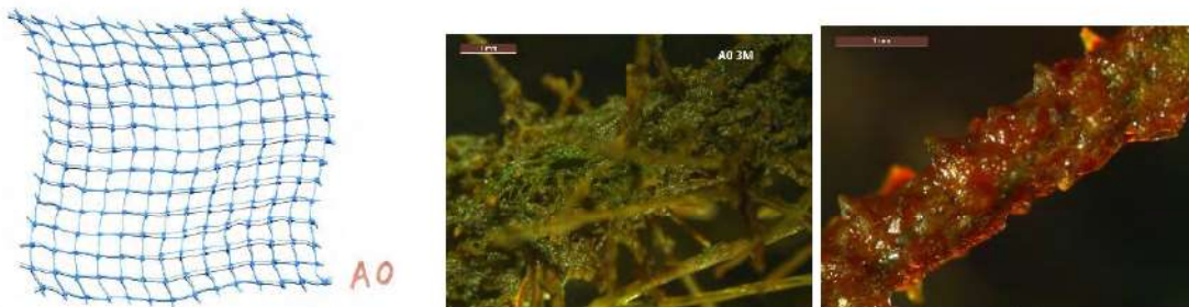
Fig 1. A) PE cage net b) PE cagenet after 3 months c) PE cagenet treated with PANI+nano CuO after three months exposure in the estuary.

Biofouling is a major problem in the aquaculture cage nettings and its management measures are very expensive. CIFT carried out research on nano material coated aquaculture cage nets and tests revealed that the coatings were efficient in preventing the biofouling in cage nets. Polyethylene cage nettings surface was modified with polyaniline and the nano copper oxide coating prevented the attachment of foulers.