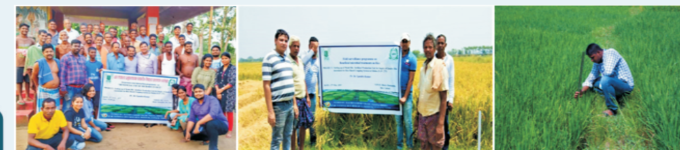
Fig. 3. Farmers awareness cum demonstration programme on endophytic and rhizospheric nitrogen fixing liquid bioinoculant for rice at Puri and Cuttack, Odisha during 2018-19.