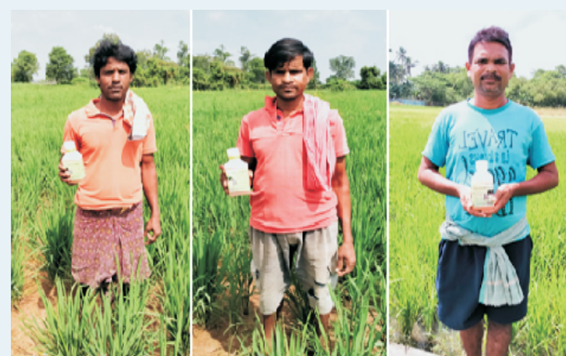
Fig. 4. Feedback moments from benefitted farmers at Puri and Cuttack, Odisha.