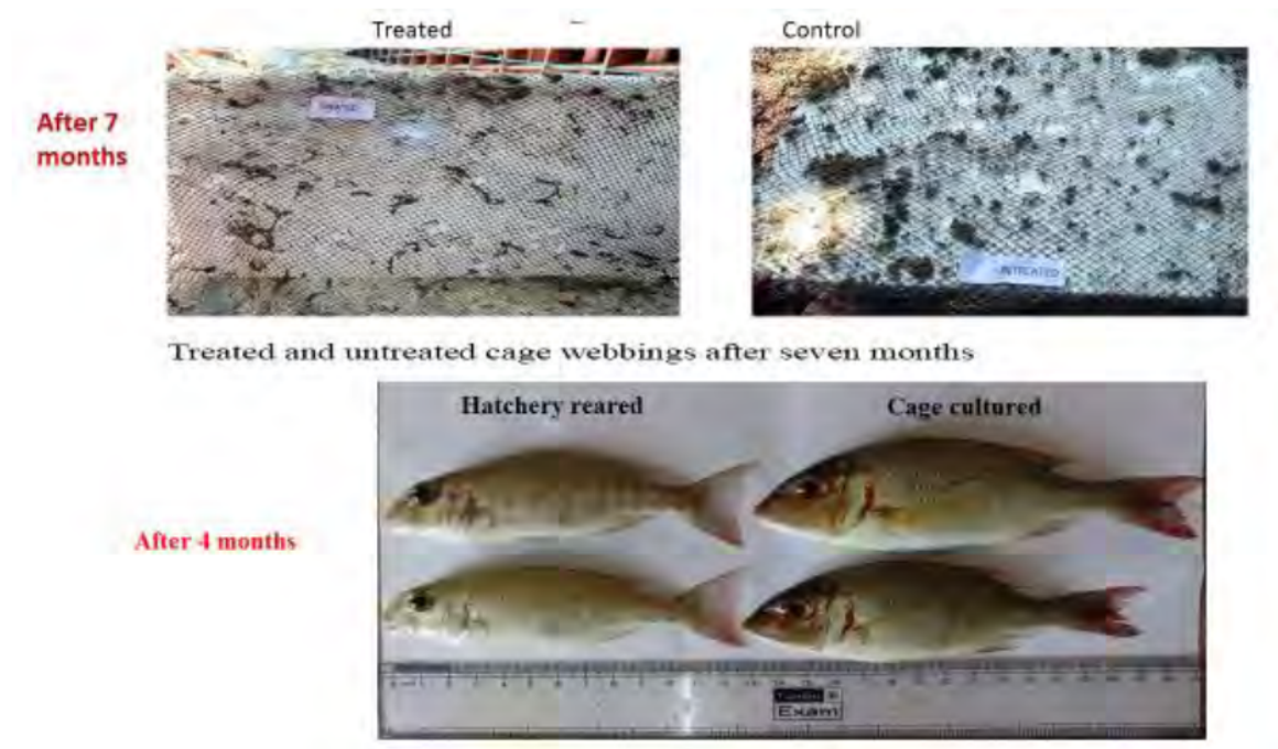
Fig 1. Control and treated net after 7 months exposure in the marine environments.

To study the biofouling resistance of the treated net can be evaluated by different methods. The field evaluation of the cage net showed the excellent biofouling resistance after 90 days exposure in the estuarine environment. The experiment was repeated by constructing a cage with treated and control panels and exposed in the Vizhinjam coast for 7 months (fig 1). The fishes grown in the cages and controlled environments were compared and exhibited significant difference in growth was shown.