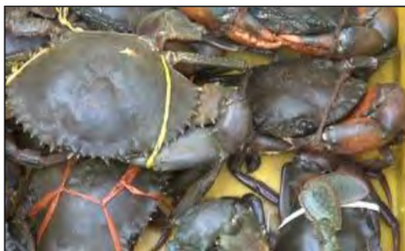
Transportation of crab in live condition

There is a great demand for live fish and shellfishes, the world over. These products fetches maximum price compared to all the other forms of value added products as it maintains the freshness. The candidate species for live transportation include high value species, cultured grouper, red snapper, seabreams, seabass, red tilapia, reef fish, air breathing fishes, shrimp, crabs, lobster, clams, oyster and mussels. These are normally transported in air cargo maintained at low temperature in order to lessen the metabolic activities of the animals.