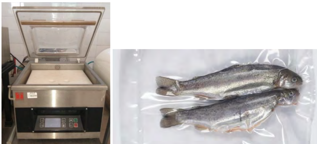
Vacuum packaging machine and Vacuum packed fish