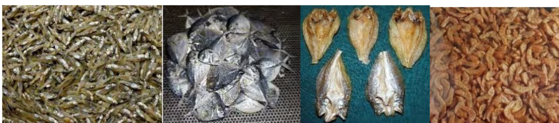
Dried fish and shellfish products prepared hygienically

Drying is probably one of the oldest methods of food preservation. It consists of removal of water to a final desired concentration, which in turn reduces the water activity of the product, thereby assuring microbial stability and extended shelf-life of the product. In some cases, common table salt (Sodium chloride) is also used to prolong the shelf life of fish. Salt absorbs much of the water in the food and makes it difficult for micro-organisms to survive.