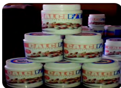
Calcium extracted from Tuna bone

Hydroxyapatite (HAp): Hydroxyapatite is the major mineral component of bone tissue and teeth, with the chemical formula of \text{Ca}_{10}(\text{PO}_4)_6(\text{OH})_2 . The composition Hap derives from