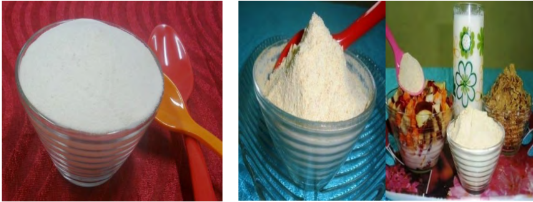
Collagen peptide from fish scale and Nutritional mix formulated by CIFT