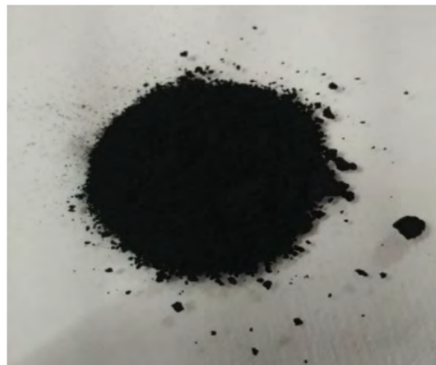
Melanin from cuttlefish ink

effective dose of 50 mg/kg body weight in mice model. Similarly, oral administration of melanin for protection against radiation was reported by Dadachova et al (2016). The protective activity of melanin is primarily attributed to the inhibition of radiation-induced hematopoietic damages. Several other physiological studies conducted on squid ink also revealed significant effects on granulopoiesis of hemopoiesis impaired mice induced by ^{60}\text{Co} \gamma cyclophosphamide, but has no effect on erythropoiesis. Melanin has been widely and conventionally used as an antioxidant and natural colorant in food formulation. The most interesting thing is that melanin can be used as food additives to prevent the rancidity caused by the presence of bacteria by quenching the bacterial quorum sensing. Squid melanin was reported to have hemopoietic function in Iron Deficiency Anaemic rats, which might be exploited as a safe, efficient new iron tonic. Deficiency of melanin is associated with disorders such as vitiligo and oculocutaneous albinism. Interestingly, melanin is thought to play a protective role against the age-associated and noise-induced hearing loss. Recently, the anti-ageing property of melanin was demonstrated in mice model, suggesting its use in nutraceutical formulations. Even though melanin is a part of normal human diet, research on dietary intake of melanin is not much explored.