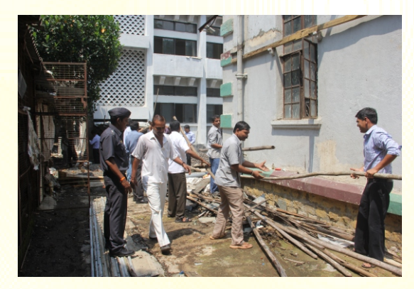
CIRCOT staff during cleaning activity

Cleanliness is next to the godliness. To follow the guidelines from the Council, on September 30, 2014 all CIRCOT staff members voluntarily participated in the cleaning of institute premises by forming human chain.