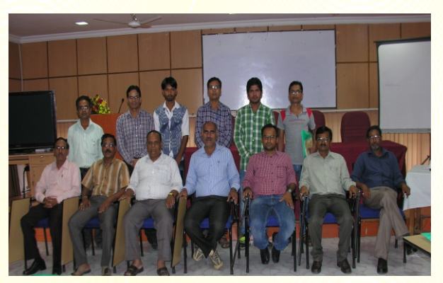
Trainees with GTC Nagpur Staff

A week training programme on 'Cotton Processing, Classing and Marketing' was arranged for ginners, classers and traders during Sept 1-6, 2014 at GTC of CIRCOT, Nagpur. Trainees from different parts of Maharashtra and Madhya Pradesh participated in this training programme. A series of in-house and guest lectures were arranged on different aspects of quality assessment, cotton grading and marketing and by-product utilization of cotton. In addition, hands on