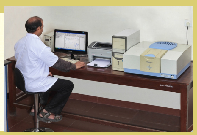
Fourier Transformation Infra red Spectrophotometer