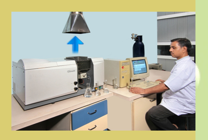
Atomic absorption spectrophotometer