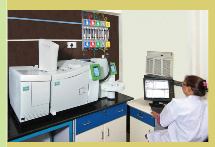
Gas chromotograph mass spectrophotometer