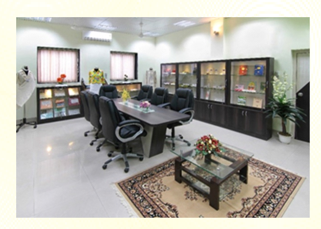
Inside view of Exhibition cum Visitors' room