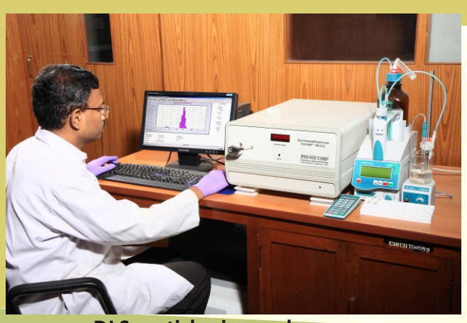
DLS particle size analyzer