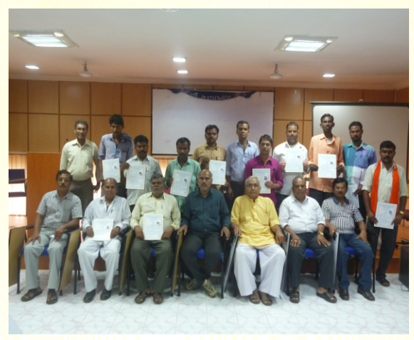
Trainees with GTC staff

A week training programme was organised on Operation and Trouble Shooting of Double Roller (DR) gins for 12 fitters of M/s. Manjeet Cotton Pvt. Ltd., Aurangabad at Ginning Training Centre (GTC) of CIRCOT, Nagpur during Sept 15-20, 2014. Trainees have undergone rigorous practical training for settings of DR gins for different cotton staples and moisture content. A series of lectures were also delivered on preservation of the inherent cotton parameters during ginning operation, increasing the productivity of DR gins, proper grooving of leather rollers, etc. A special lecture on impact of processing of extremely wet cotton on quality of lint and maintenance of DR gin was also arranged. Fitters had also opportunity to discuss their