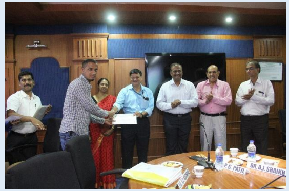
Valedictory function of Training on Chemical Characterization of Textile Material & Auxiliaries

former Head QEID also participated and shared their experience in the field of chemical testing. The feedback from the trainees indicated their overall satisfaction about the course content, lectures and practical demonstrations.