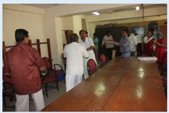
Swachh Bharat Mission

Cleaning Work by CIRCOT Staff Members During this month, cleaning of Room No. 207 in the second floor was carried out on 24<sup>th</sup> February, 2015 from 2.00 to 5.00 p.m. by forming a human chain. Old furniture, computer monitors, files, wooden partitions, etc. were removed to the ground floor for subsequent removal from the office premises.