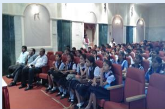
Participation of school students on the Open Day