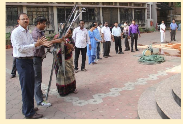
Institute staff during undertaking the cleaning activities on 1st December, 2015 in the Institute