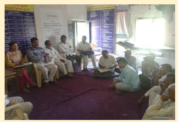
Meeting with Sarpanch and farmers at Majra panchayat office, Wardha (Maharashtra)