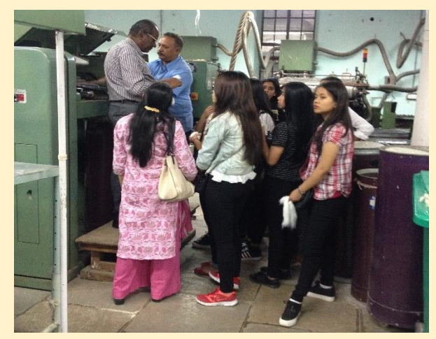
Students of College of Agril. Engg. and Postharvest Technology, Ranipool, Gangtok visited CIRCOT on 23rd December, 2015 (35 Students)