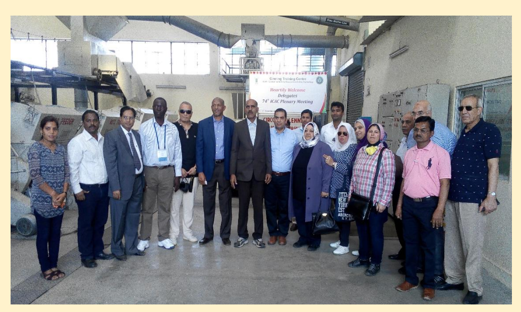
Group Photo: 74th ICAC Plenary Meeting Delegates along with officials of GTC, Nagpur