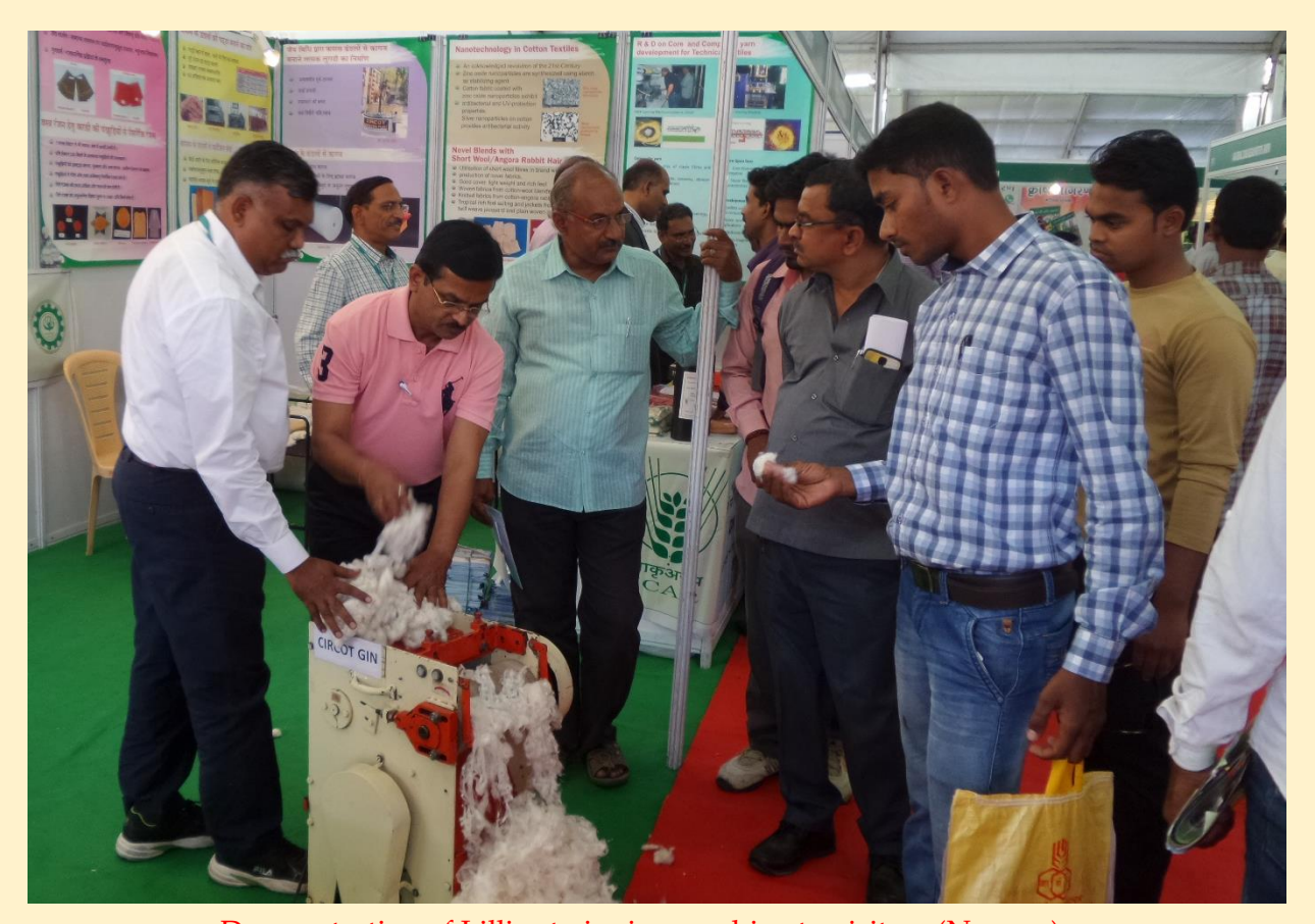
Demonstration of Lilliput ginning machine to visitors (Nagpur)