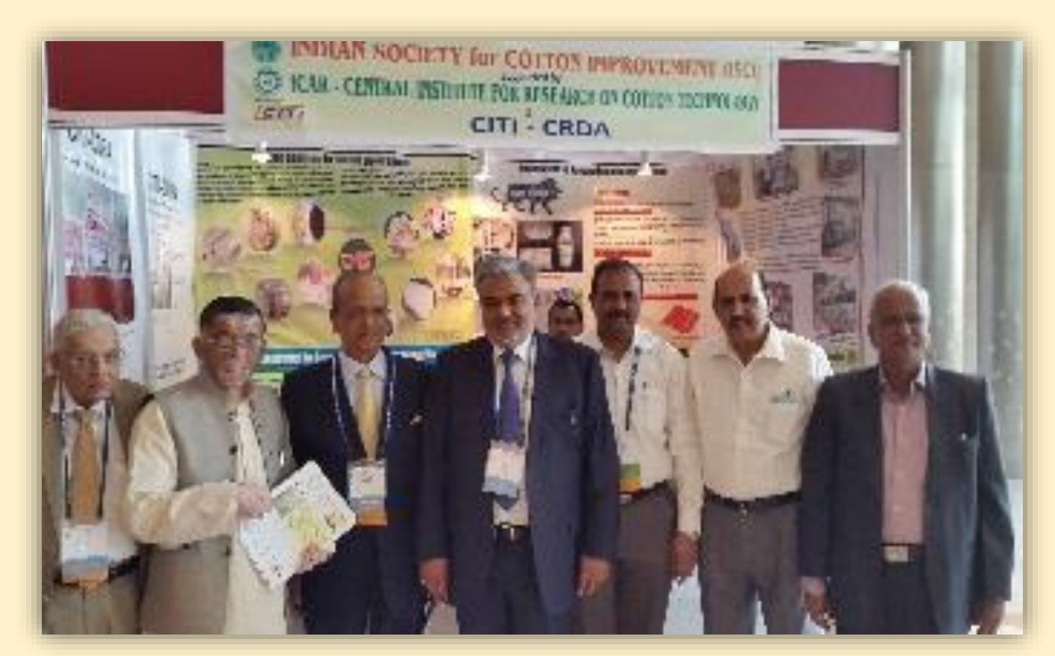
Mr. Santosh K Gangwar, Hon. Minister of state for Textiles along with dignitaries at ISCI-CIRCOT-CITI-CRDA stall (Mumbai)

Officials from about 41 cotton producing countries participated in this meeting and 7 exhibitors such as Cotton Association of India, APACHI cotton, Bajaj Steel Ind. Ltd. etc including ISCI-CITI-CRDA-ICAR-CIRCOT put their respective stalls for six days. During this event many cotton experts spoke on topics related to Sustainable Agriculture, World Cotton Market, Cotton by-products, Climate change and Cotton etc. Many dignitaries, and national as well as international visitors visited ISCI-CITI-CRDA-ICAR-CIRCOT stall and interacted with the institute staff.