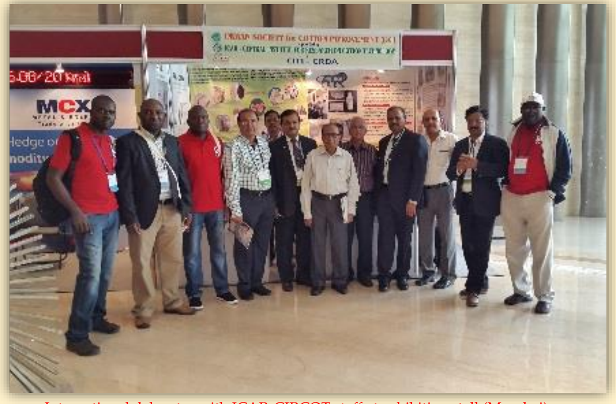
International delegates with ICAR-CIRCOT staff at exhibition stall (Mumbai)