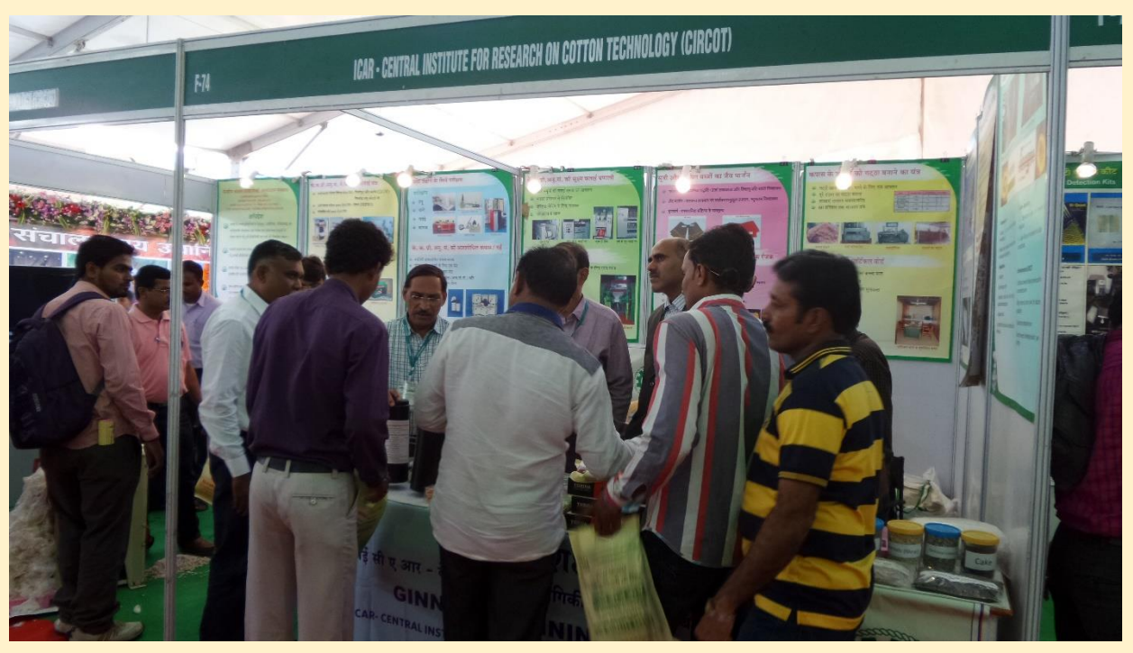
ICAR – CIRCOT Stall at Agro vision Exhibition, Nagpur