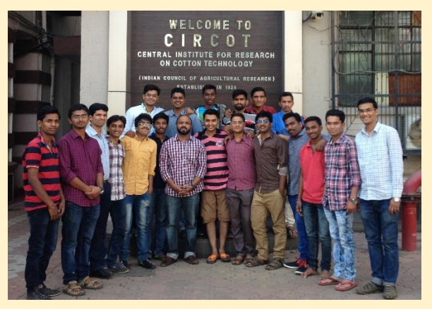
Students of DKTE, Textile and Engineering Institute, Ichalkaranji visited CIRCOT on 22nd December, 2015 (31 Students).