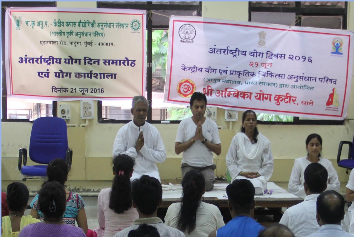
International Yoga Day and Yoga Workshop at ICAR-CIRCOT on 21 st June, 2016