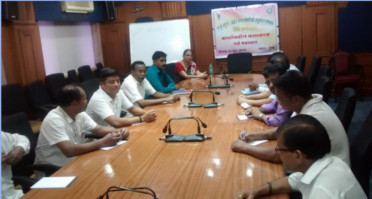
Skilled supporting staff of CIRCOT participating in Hindi Workshop