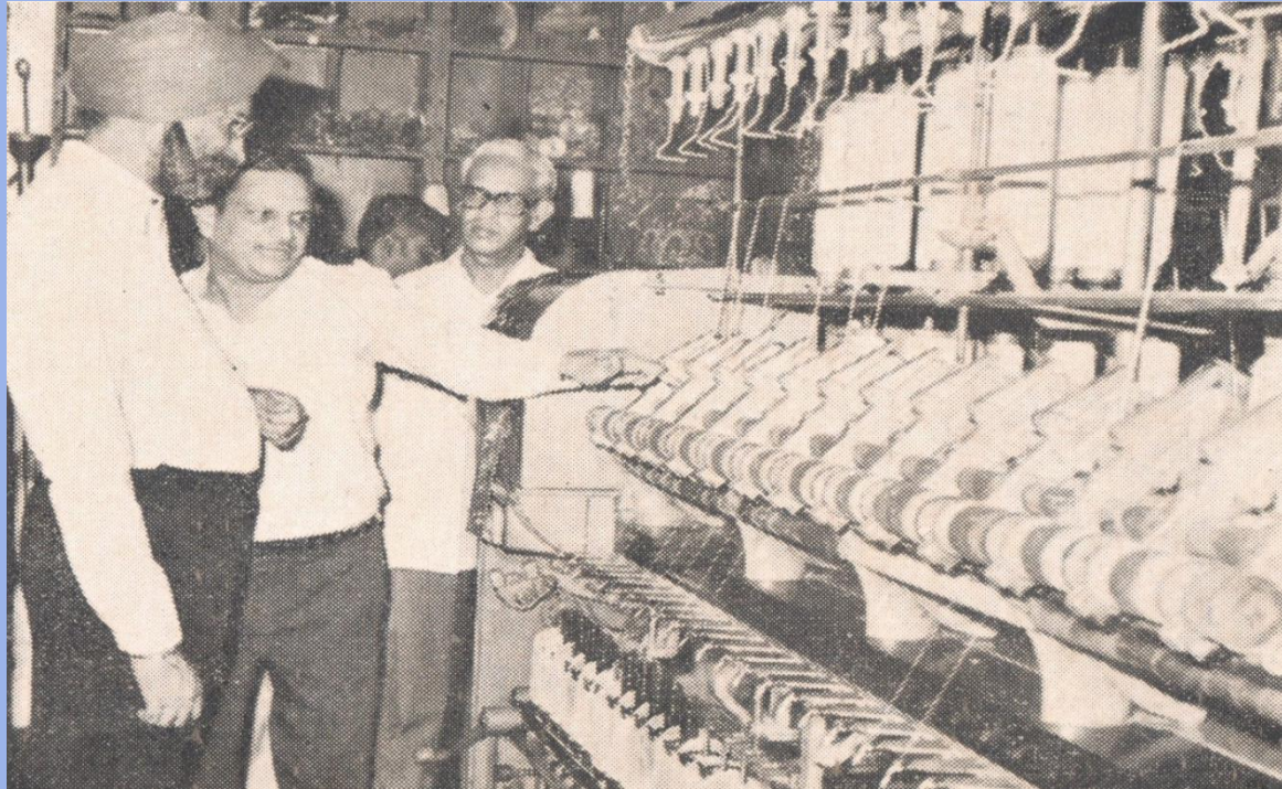
Shri S. S. Barnala, Union Minister for Agriculture and Irrigation, Govt. of India visited ICAR-CIRCOT on December 27, 1977.