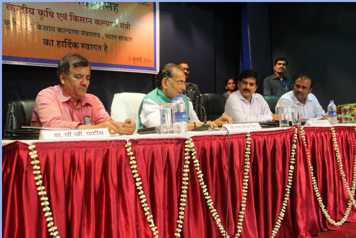
Hon'ble Union Minister of Agriculture and Farmers Welfare, Shri. Radha Mohan Singh while addressing ICAR-CIRCOT staff