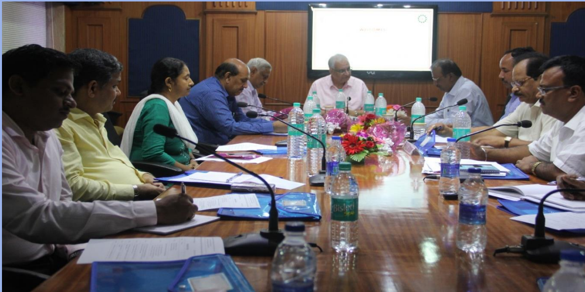
Deliberations during Advisory sub-committee meeting of Agri Business Incubation (ABI) Centre

Scientist & member of ICAR-CIRCOT-ABI Management Team on the progress of activities. The management support being provided to the three admitted entrepreneurs and their future course of action was also discussed in detail.