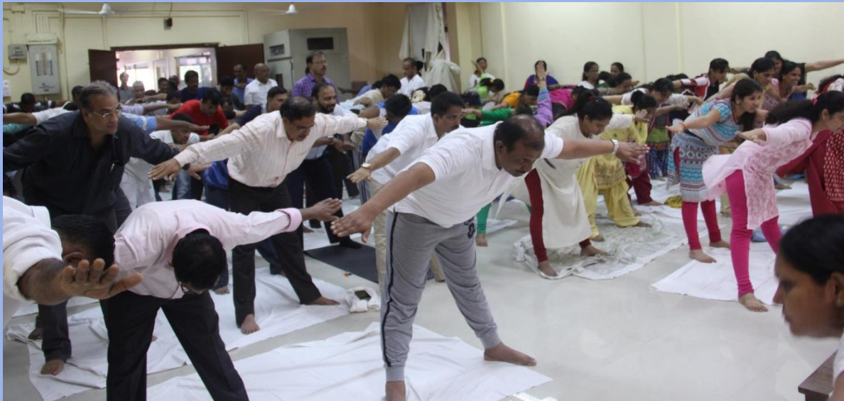
ICAR-CIRCOT staff performing yoga on International Yoga Day