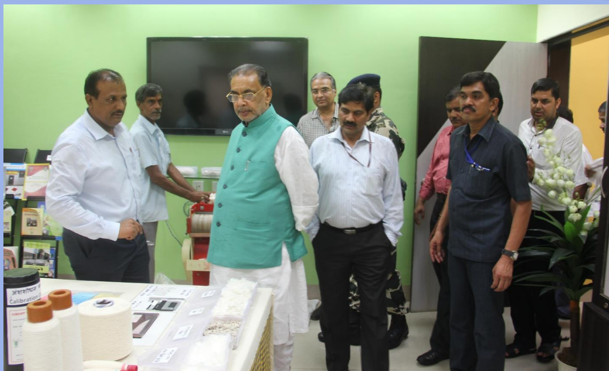
Hon'ble Union Minister of Agriculture and Farmers Welfare, Shri. Radha Mohan Singh in exhibition Hall of Institute