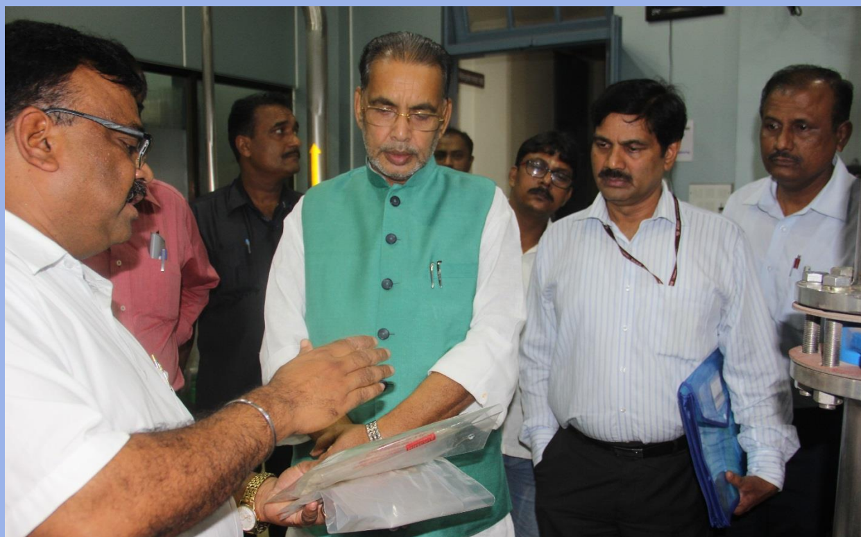
Hon'ble Union Minister of Agriculture and Farmers Welfare, Shri. Radha Mohan Singh in Nanocellulose Pilot Plant