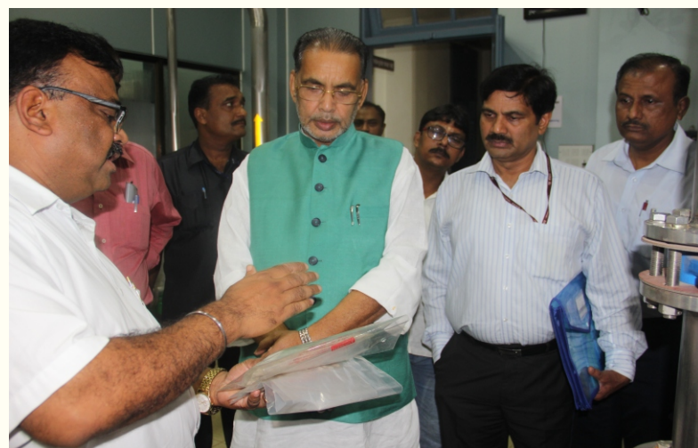
Hon'ble Union Minister of Agriculture and Farmers Welfare, Shri. Radha Mohan Singh in nanocellulose pilot plant