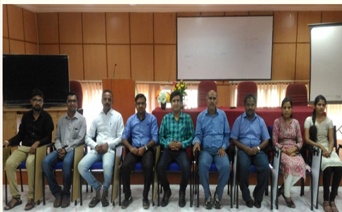
Group photo of trainees who attended training programme on “Double Roller Ginning Technology and Cotton Quality Evaluation” held at GTC, Nagpur.

A one-week training program on Double Roller Ginning Technology and Cotton Quality Evaluation was conducted at Ginning Training Centre, Nagpur during 11-16 July, 2016. The program dealt with fibre quality assessment, cotton grading and marketing, DR ginning technology, cotton export and cotton by-products utilization. The practical aspects of repairs and maintenance of ginning and pressing machinery, assessment of gin outturn, stapling of cotton fibres and validation of results with instruments, etc were covered. The trainees were demonstrated the functioning of ginning and pressing plant, particle board plant and scientific cottonseed processing unit. Participants were taken for the industrial visits to M/s. Bajaj steel Industry, M/s. Sri Bhagirath Textiles Ltd. and M/s. Balaji Bio-coal Briquetting Plant.