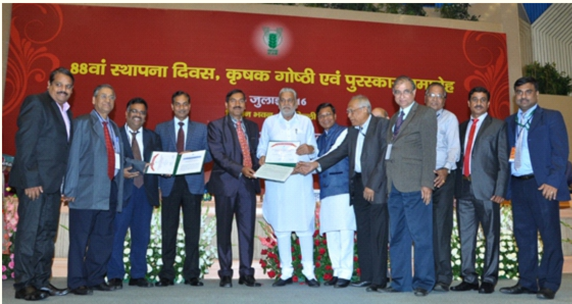
Hon'ble Union Ministers of State, Shri Parshottam Rupala and Shri Sudharsan Bhagat, conferring ICAR award for outstanding interdisciplinary team research