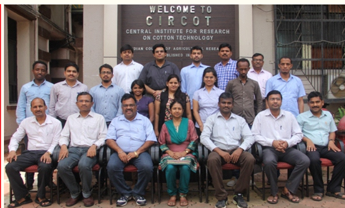
Group photo: Trainees who attended training programme on “Electrospinning techniques & their applications” held at CIRCOT Mumbai.

A special training programme on “ Electrospinning Techniques & Their Applications ” was conducted at ICAR-CIRCOT, Mumbai during 11-13 July, 2016. The main objective of the programme was to acquaint the trainees with the basics of electrospinning techniques and their applications in various fields. Twelve participants with diverse backgrounds from various Research Institutions and Industry attended this programme. First hand information cum training in operation of electrospinning equipment is imparted in electrospinning lab of the institute.