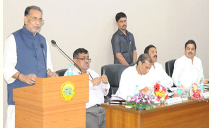
Hon'ble Union Minister of Agriculture and Farmers Welfare Shri Radha Mohan Singh while addressing the gathering