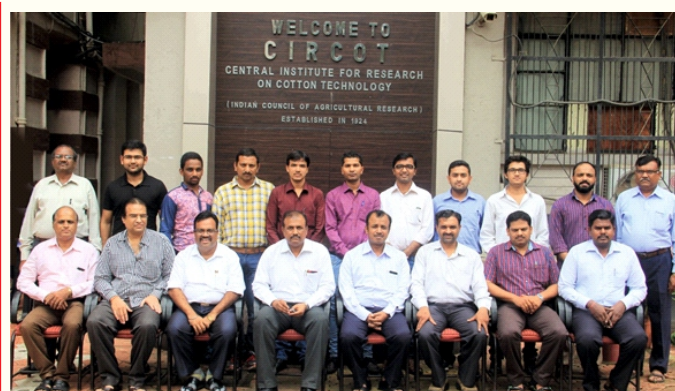
Group photo: Trainees who attended training programme on “Quality evaluation of cotton” held at CIRCOT Mumbai

Five days training programme on Quality Evaluation of Cotton was conducted during July 18-22, 2016 at ICAR-CIRCOT, Mumbai. Eight participants from cotton trade and industry participated in this training. This programme covered the basics of cotton grading, quality evaluation & its importance in trading, fibre attributes & their impact on yarn quality, contamination in cotton, marketing & commercial aspects of cotton, ginning & mechanical processing and its effect on cotton economics. Practical knowledge and skill were imparted about length, fineness, maturity, tenacity, cotton grades, spinning and yarn testing.