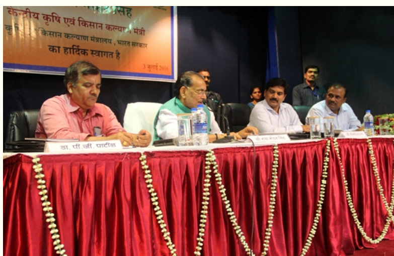
Hon'ble Union Minister of Agriculture and Farmers Welfare, Shri. Radha Mohan Singh while addressing ICAR-CIRCOT staff