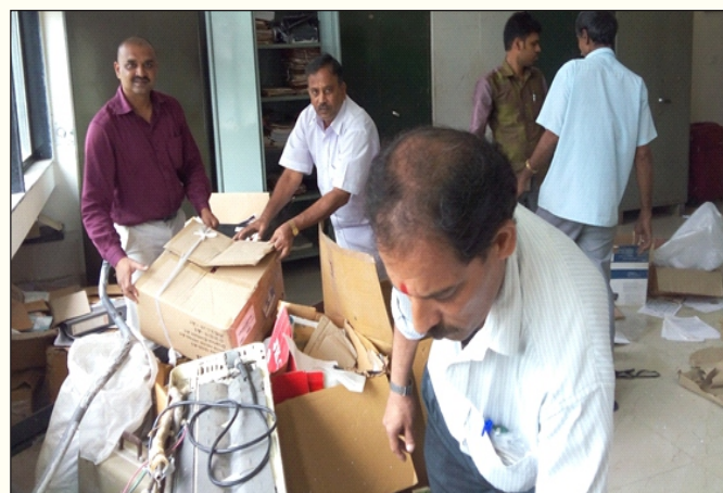
ICAR-CIRCOT staff at cleaning activities on 29 th July 2016.

The staff of the institute formed a human chain and removed old scrap, unserviceable items damaged papers from Technology Transfer Division on 29 th July 2016.