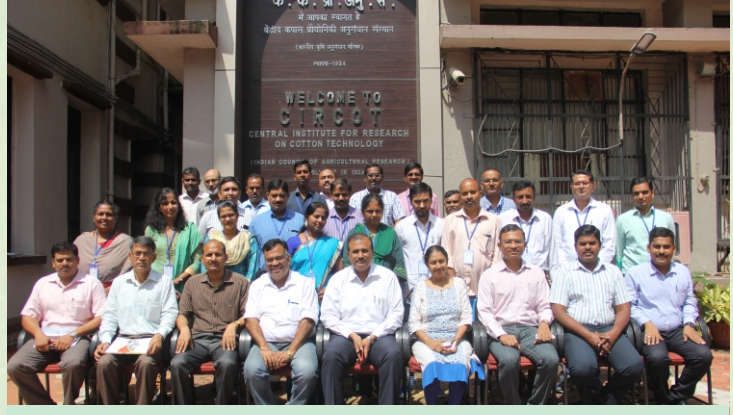
Group photo of trainees of the ICAR short course held during September 19-28, 2016