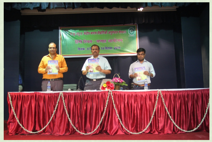
Hindi magazine AMBER being released on September 14, 2016