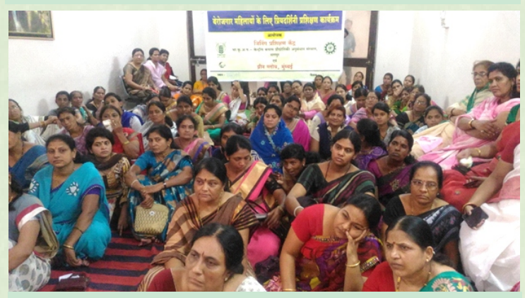
Training program for women organized at Amravati on September 28, 2016