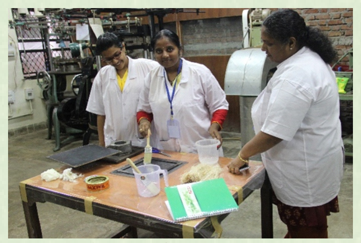
Hands-on practical training on preparation of nano composites