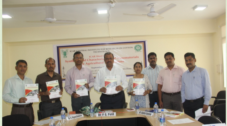
Release of the training manual: ICAR short course on synthesis and characterization of nano materials for agricultural applications