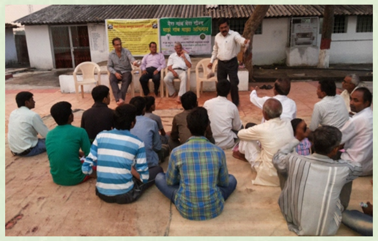
Mera Gaon Mera Gaurav programme at Sonegaon, Wardha on September 26, 2016