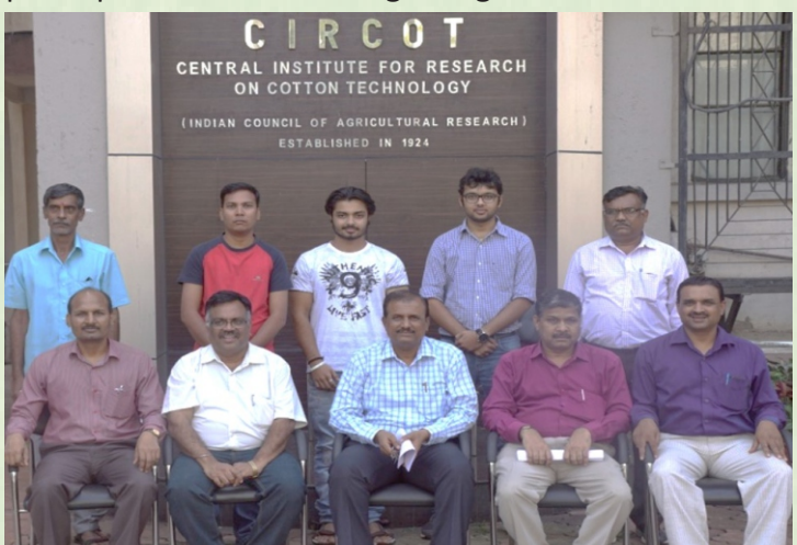
Group photo of a training programme on Quality Evaluation of Cotton organized during September 26-30, 2016

In line with the skill development initiative of the Govt of India, a five day training programme on "Quality Evaluation of Cotton" was organized during Sept. 26-30, 2016 at Mumbai for participants from the Cotton Trade and Industry. This programme focussed on basics of cotton grading, quality evaluation & its importance in trade. Practical classes and demonstrations on cotton quality assessment, cotton grades, spinning and yarn testing were also conducted. In addition, a visit to Cotton Association of India was arranged to expose the participants to commercial grading of cotton.