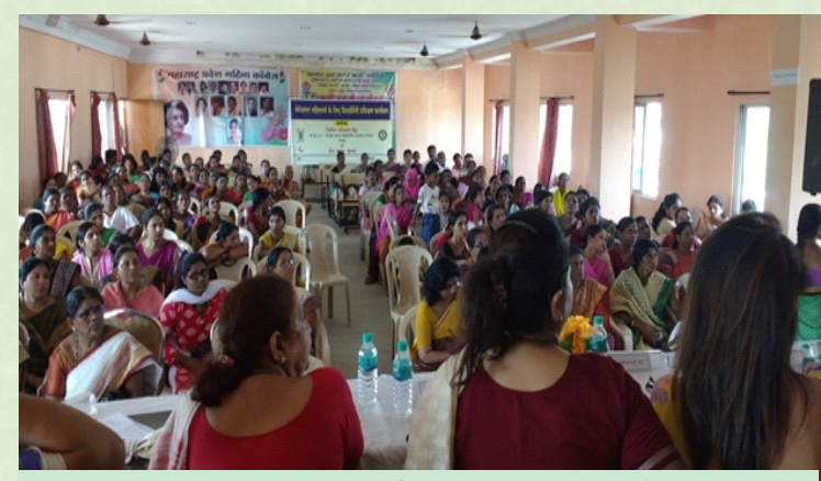
Training program for women organized at Wardha on September 27, 2016

of women farmers. The programme covered topics like cultivation of oyster mushroom using cotton stalks, surgical cotton preparation, poultry feed from cotton seed meal and preparation of briquettes and pellets from cotton and other agro residues. Dr S.K. Shukla, In-charge, GTC, Nagpur briefed about the institute research activities and utilization of cotton stalks and other agro residues to increase farm income. Demonstrations on preparation of value added products from cotton stalks were also conducted.