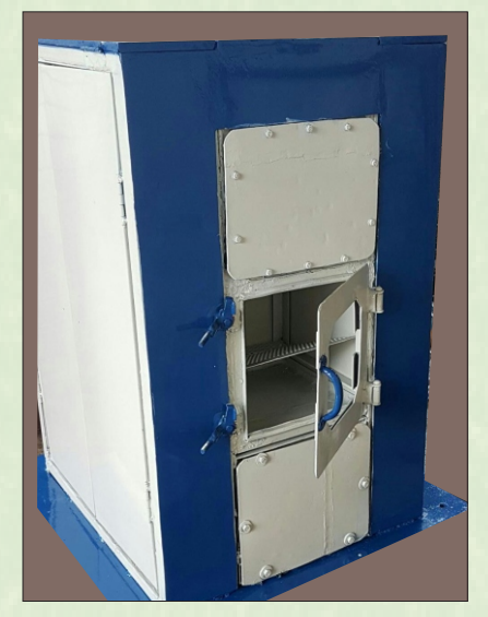
Cotton lint opener

Cotton lint samples from densely packed bales should be properly opened and cleaned for accurately measuring the fibre quality parameters using High Volume Instruments. Presently, testing laboratories either employ human labour or use trash analyzer for the purpose of opening cotton lint samples for testing. In both these methods, the extent of lint opening is not uniform or optimum and the speed is also very slow. Therefore, a new device has been designed to give uniform and desired lint opening at faster rate without any damage to the cotton fibres. The research prototype of the lint opener has been fabricated and tested for performance evaluation.