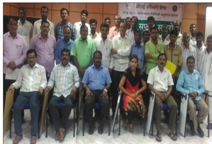
Group Photo: Farmers from Jalgaon, Maharashtra attending the training programme at GTC Nagpur during September 18-21, 2017