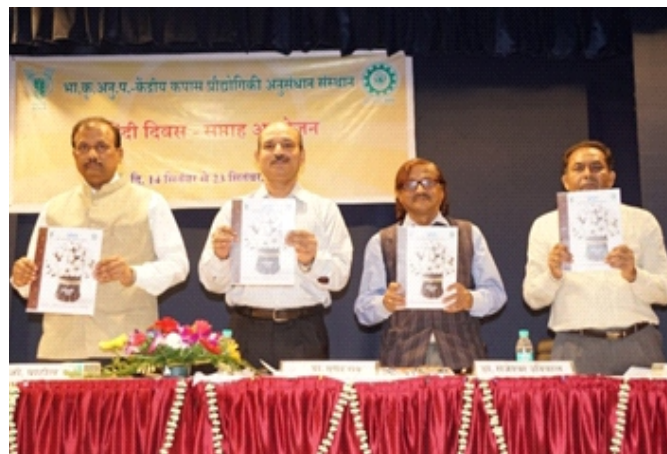
Releasing Amber (issue-3) Magazine and Hindi Annual Report on Hindi Day