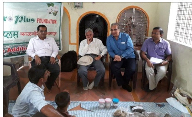
Mera Gaon Mera Gaurav Programme at Ratnapur, Wardha

Checking of lint quality before selling to the factories, following of proper agronomic practices, judicious use of chemical pesticides were some of the issues discussed. The farmers were also sensitized about the production of briquettes and pellets from cotton stalks for value addition to cotton wastes. The meeting was followed by demonstration of pest & disease identification in cotton field during the field visit.