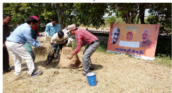
Cleaning programme at Regional Quality Evaluation Unit of CIRCOT, Coimbatore