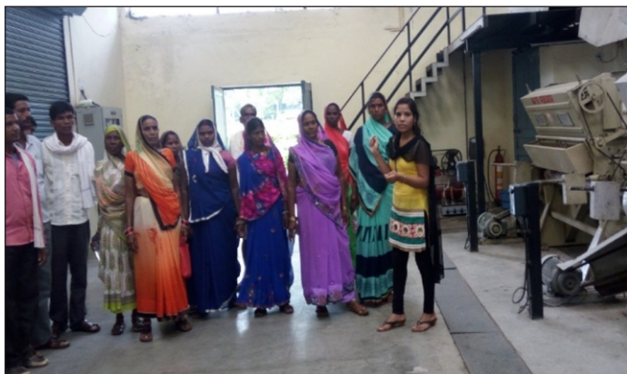
Group photo of Madhya Pradesh Farmers visit to GTC, Nagpur