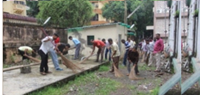
Glimpses of “Swachhta Hi Seva” Campaign at ICAR-CICOT, Mumbai