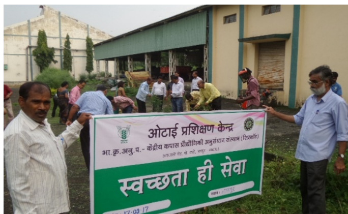
“Swachhta Hi Seva” Campaign at GTC, Nagpur