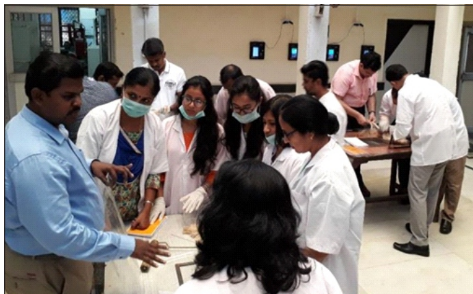
Participants getting hands-on training on nanotechnology