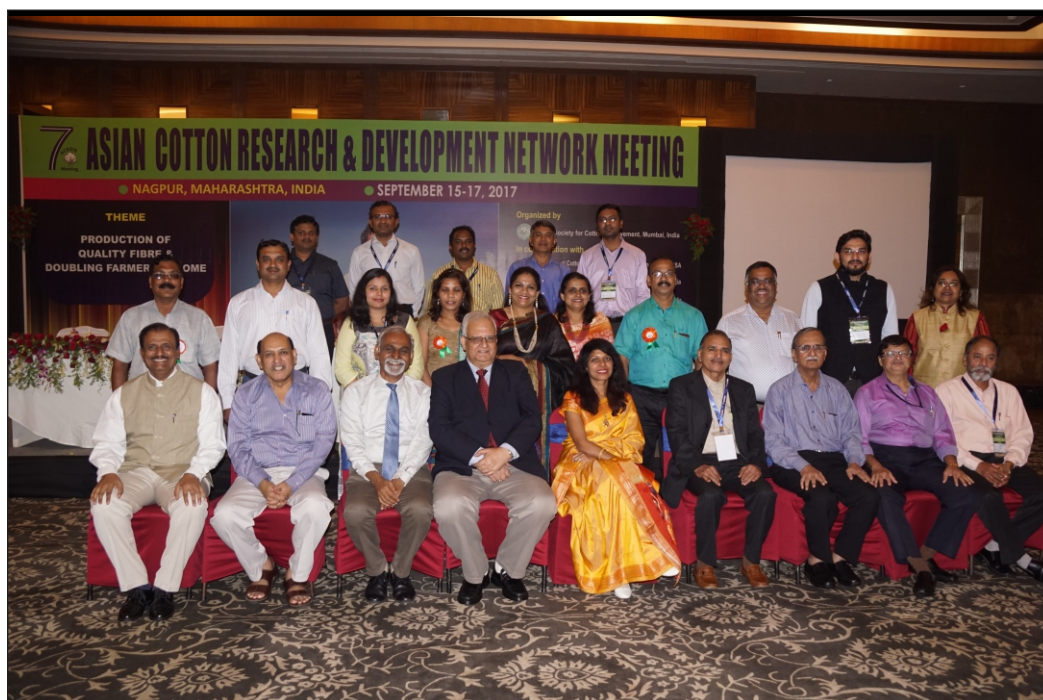
ICAR-CIRCOT staff along with delegates at the 7 th ACRDN Meet, Nagpur