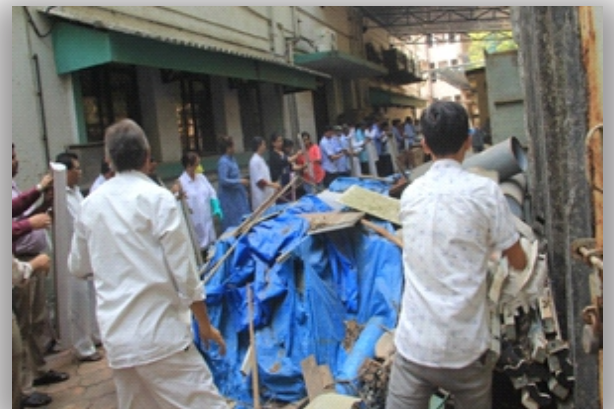
Cleanliness being carried out in the Institute campus premises