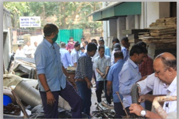
Cleanliness being carried out in the Institute campus premises