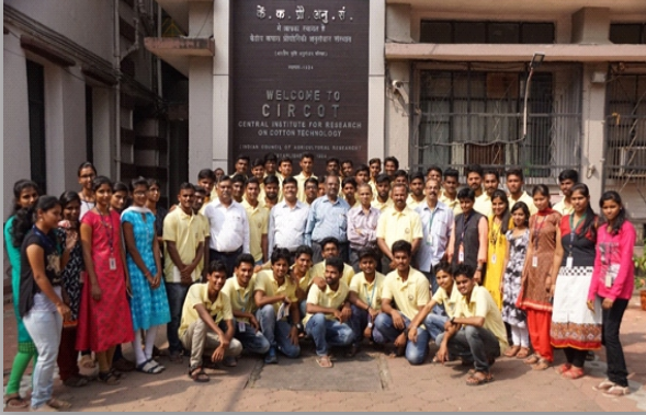
Visit of students from College of Agricultural Engg., Raichur

Students of College of Agricultural Engineering, Raichur (UAS, Raichur) visited the Institute on November 17, 2017. They were briefed about various tests carried out in FT, YT and MPD of the Institute. Demonstrations were given to them to understand the basic concepts of cotton processing.