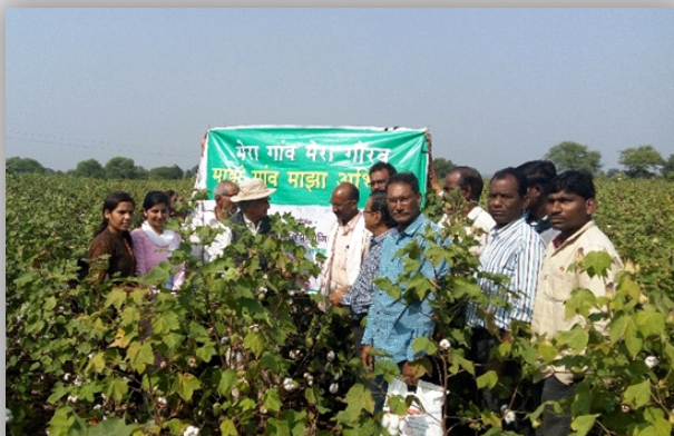
Field visit during MGMG Programme at Sawali (Wagh) village, Wardha