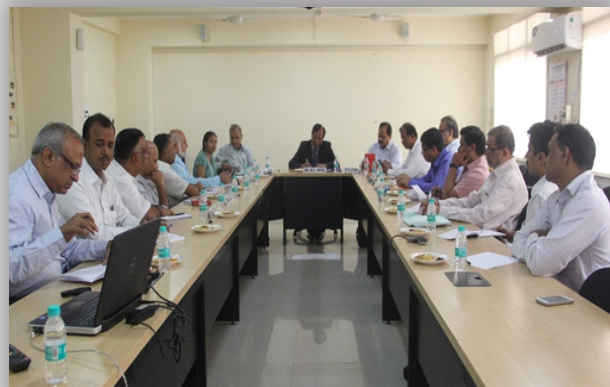
Interactive meet of QRT members with CIRCOT stake holders