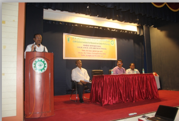
Vigilance Awareness Week-2017 observed at ICAR-CIRCOT Mumbai