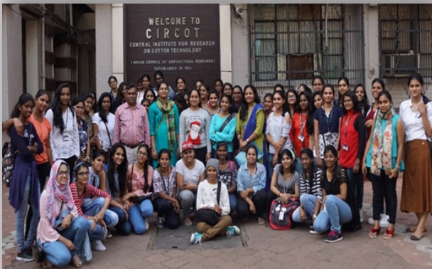
Visit of girl students from St. Francis College, Hyderabad

Girl students from Dept. of Biochemistry, St. Francis College, Hyderabad visited the Institute on November 20, 2017. They visited the nano lab in chemical and biochemical processing division to understand the nano particles preparation process. They were briefed about use of nanotechnology in cotton and allied sectors.