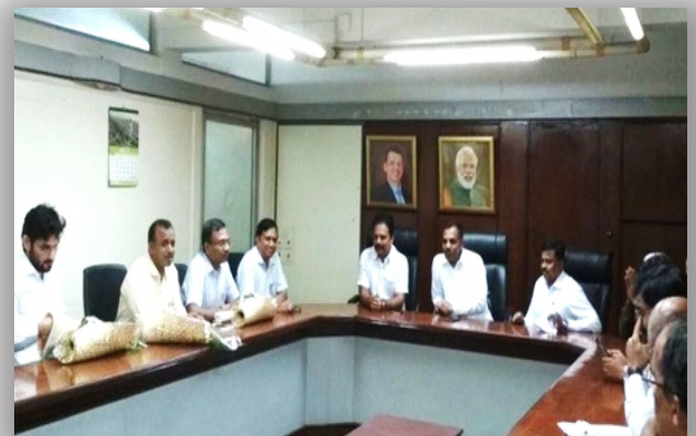
ICAR-CIRCOT scientists interacting with the APMC officials at Pune