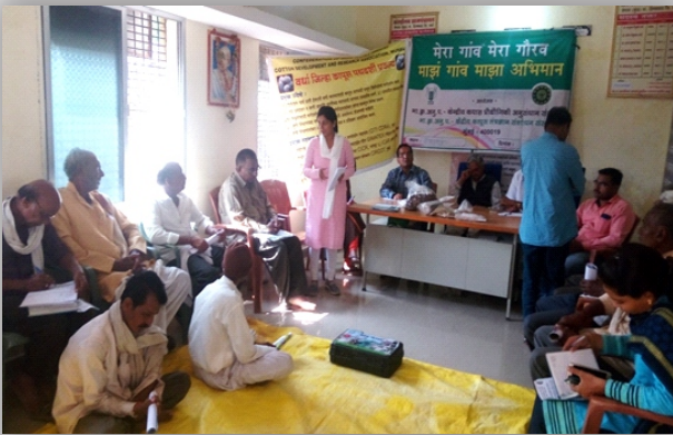
MGMG Programme at Shegaon (Kund), Wardha