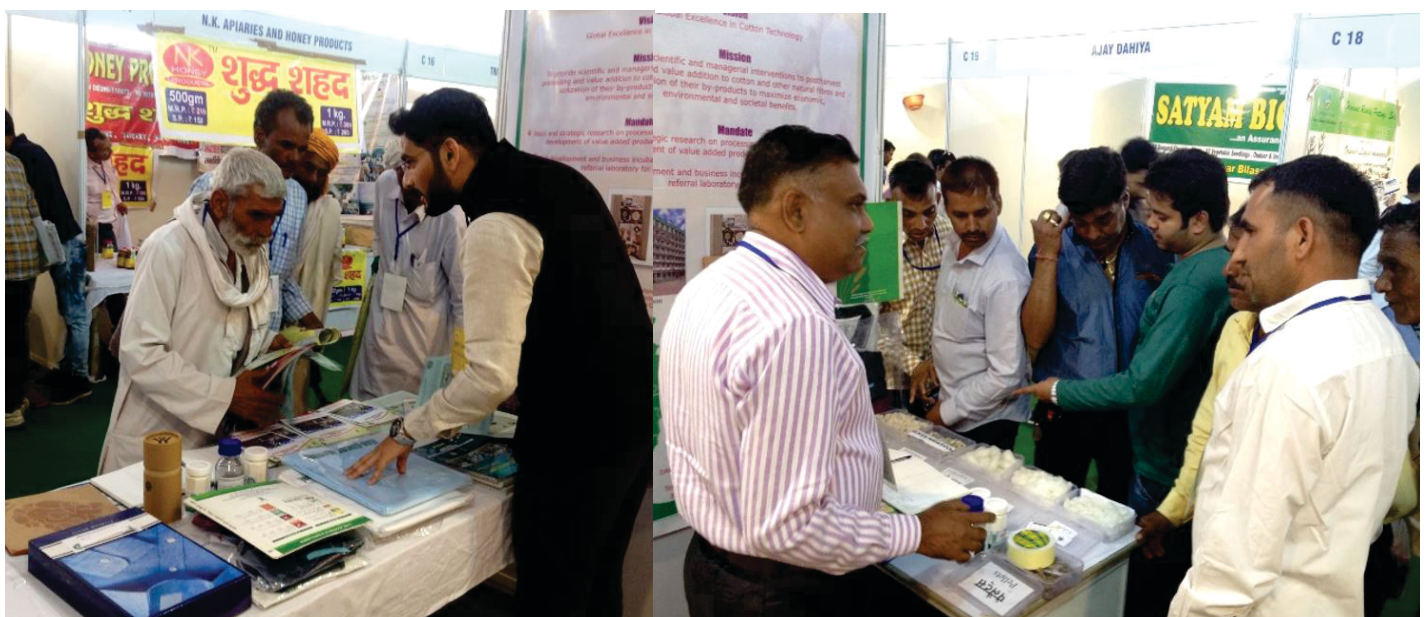
ICAR-CIRCOT's stall at Krishi Unnati Mela, New Delhi