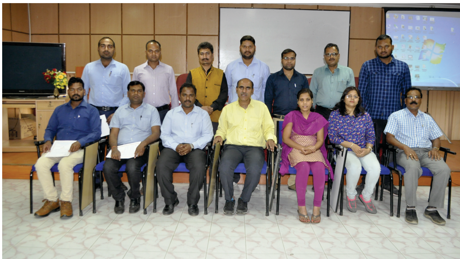
Group Photo- Training programme on “Cotton Quality Assessment, Grading and Marketing”

promotion of cotton cultivation and quality based marketing in the state. The training programme covered practicals and lectures on cotton quality parameters, manual stapling, grading, marketing, operation of different testing equipment, etc. Besides, trainees were also provided detailed information about the facilities and infrastructure needed to establish a cotton testing laboratory.