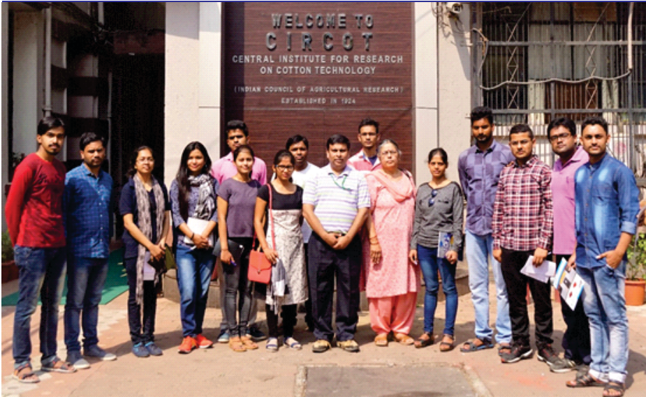
Students of IARI, New Delhi at ICAR-CIRCOT