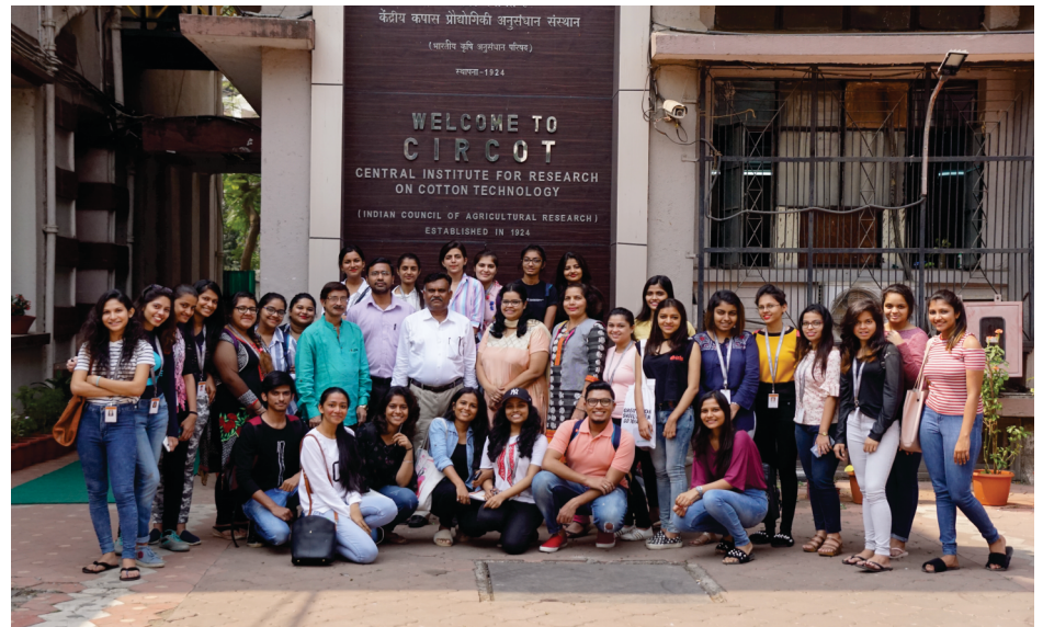
Students of Mithibai College, Vile Parle, Mumbai at ICAR- CIRCOT