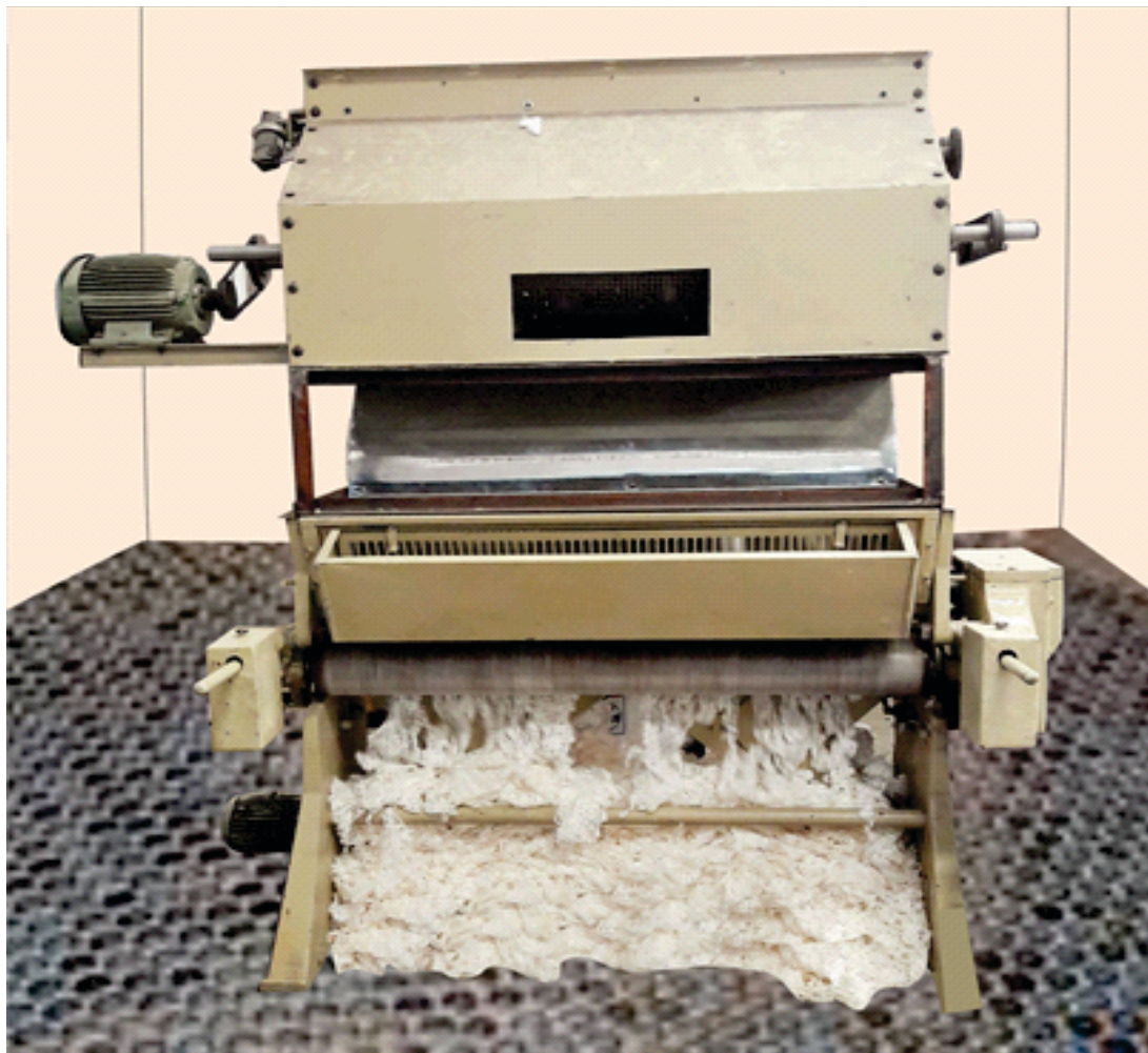
Spike cylinder single locking cotton feeder was developed at ICAR-CIRCOT

energy. Optimum moisture level of 7.38 & 7.15 % and spike cylinder speed of 307 & 297 RPM with desirability of 0.9185 & 0.8923 was arrived using multiple regression analysis for long and medium staple cotton respectively. Use of single locking cotton feeder for long and medium staple cotton resulted in 22 & 25 % increase in ginning output and 12 & 13.5 % reduction in specific energy requirement respectively as compared to conventional system comprising of auto feeder. Single locking feeder showed significant improvement in colour grade of cotton. Other HVI and AFIS fibre quality parameters remained unaffected. With these advantages, single locking feeder would be highly useful for cotton ginneries.