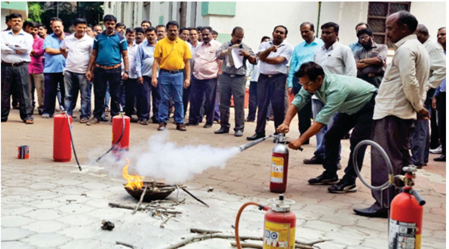
Firefighting demonstration on March 17, 2018

A fire-fighting demonstration was organized on March 17, 2018 to acquaint the staff about the operation of fire extinguishers. The demonstration was conducted by Nishant Enterprises, Thane.