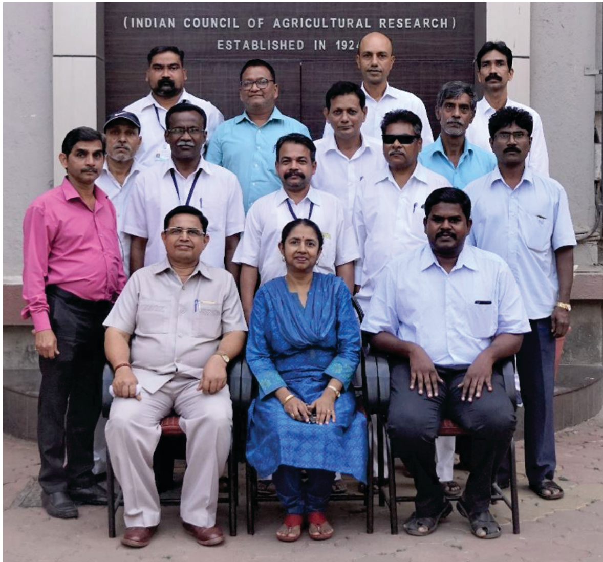
Training Programme on “Industrial Safety and First Aid” for Skilled Support Staff