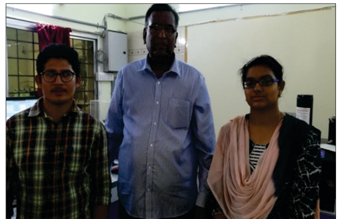
Students of Acharya NG Ranga Agricultural University, visited CIRCOT's QE unit at Guntur