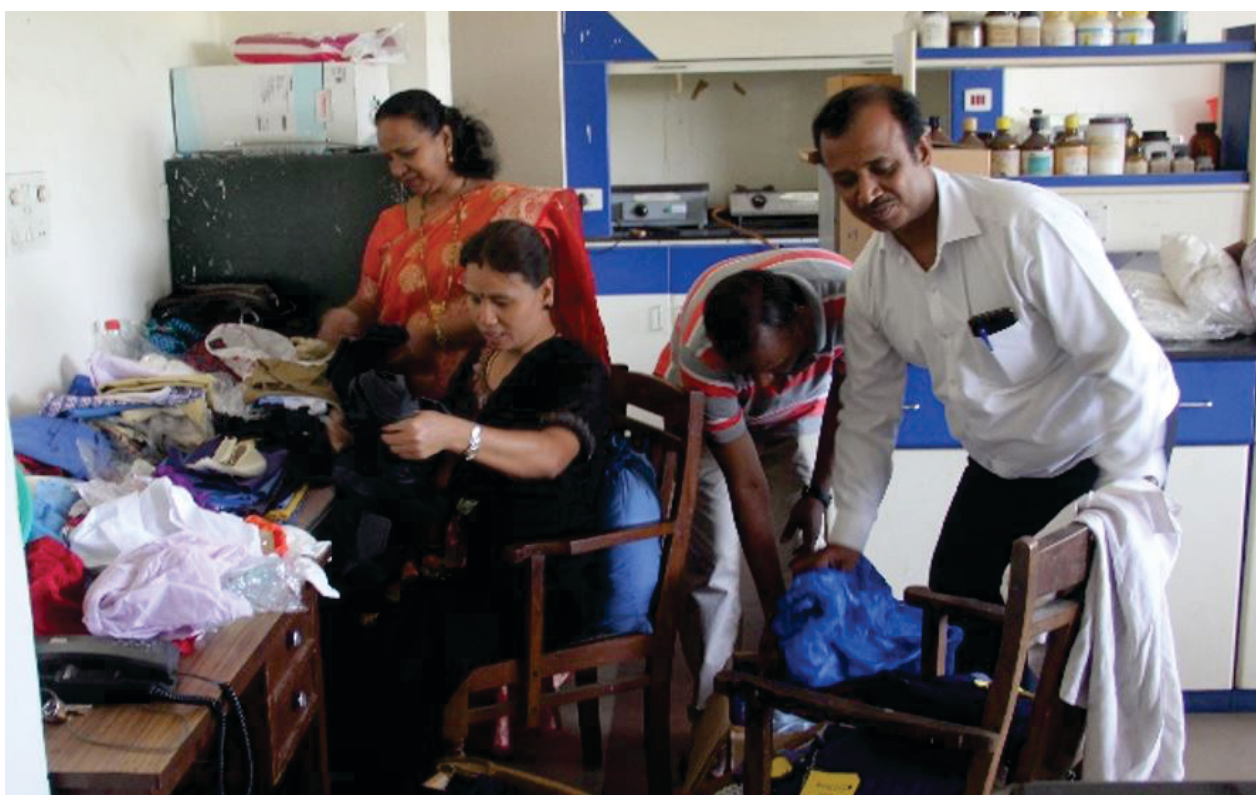
CPBD staff during the cleaning programme