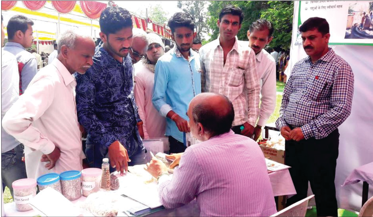
ICAR-CIRCOT's stall at Kisan Mela, Nagpur