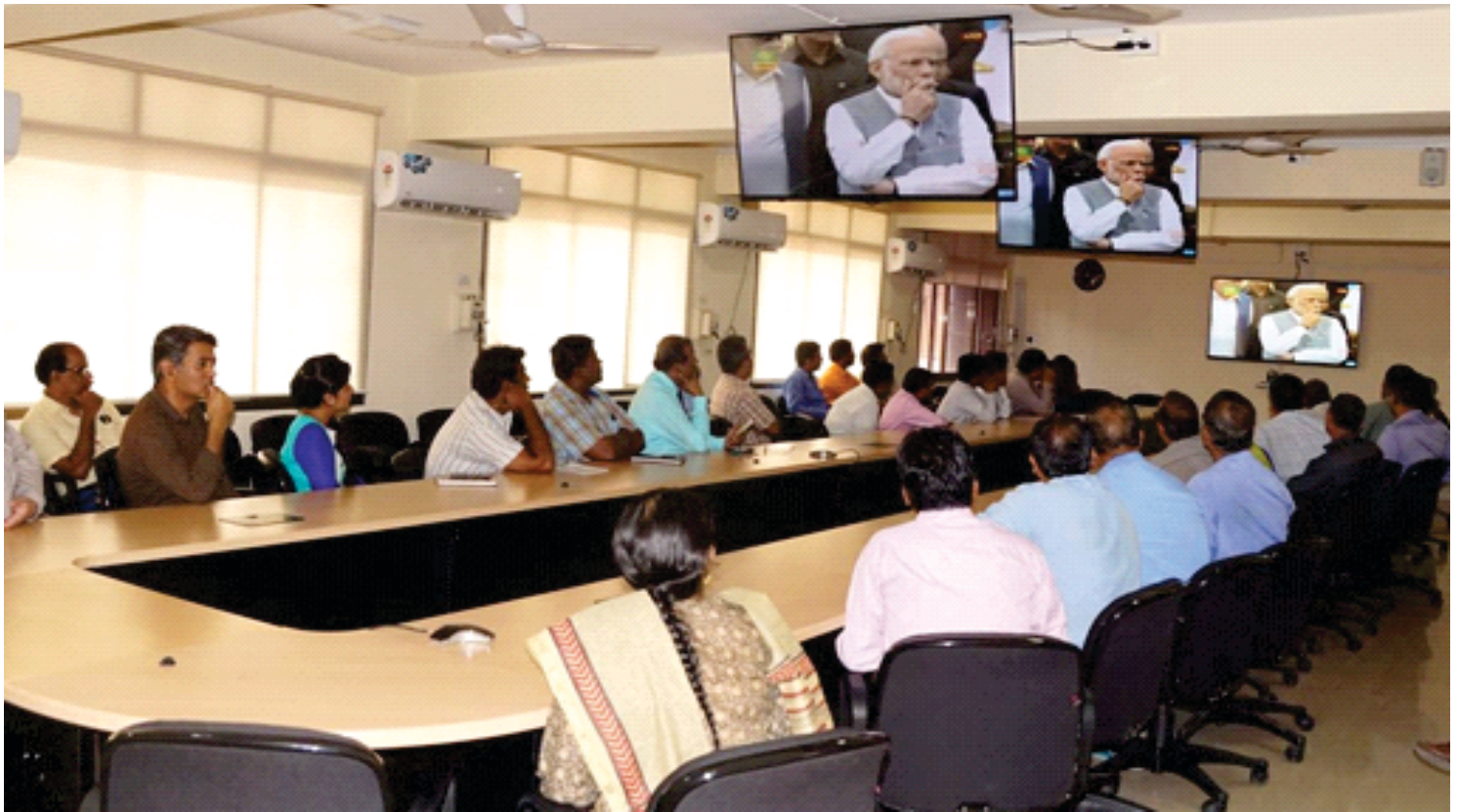
Live webcast of inaugural function of Krishi Unnati Mela-2018