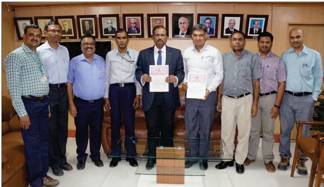
MoU signing with M/s Forech Mining & Construction International LLP, New Delhi