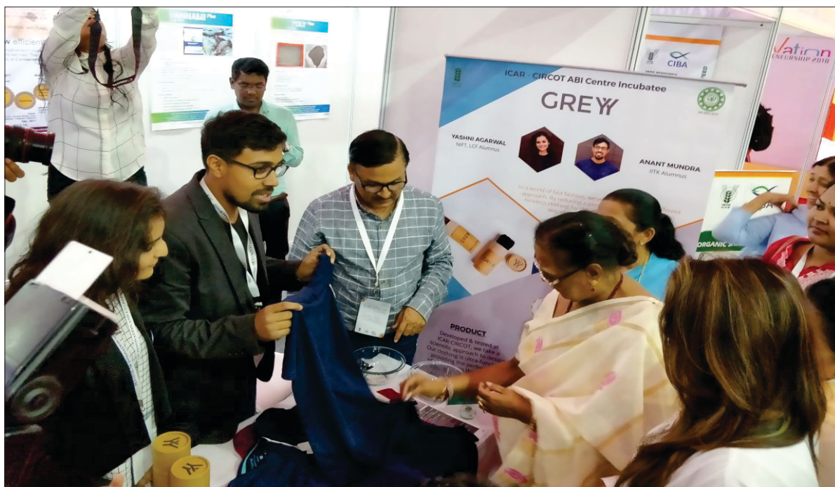
Mrs. Savita Kovind, Hon'ble First Lady of India visiting Incubatee stall