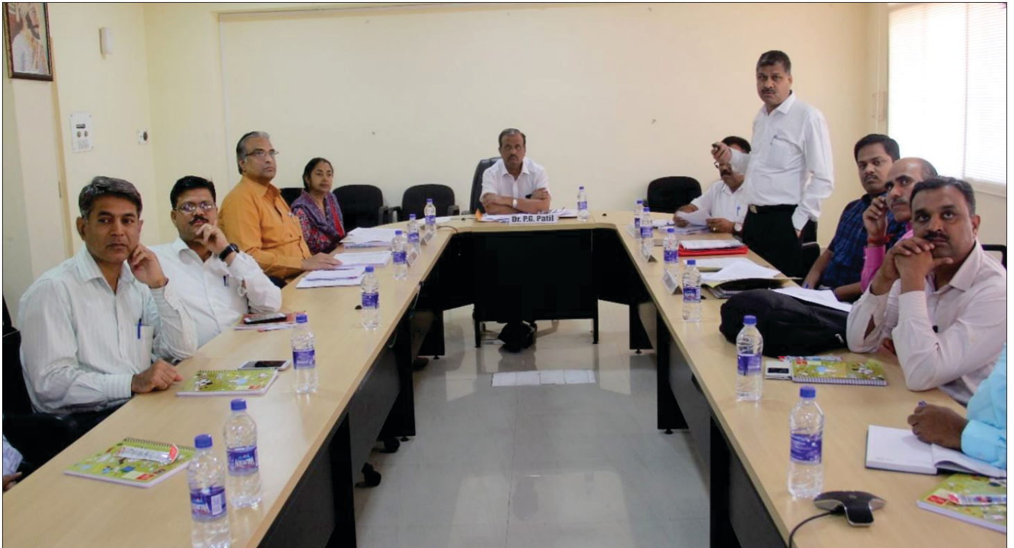
118 th IRC meeting at ICAR-CIRCOT

that the scientists should strengthen the research consultancy and bring in Industry partners to collaborate in their research projects for the ease of technology commercialization. The achievement of the Institute in revenue generation (> Rs. 1.5 crore) and the efforts of GTC, Nagpur for its contributions (> Rs. 50 Lakhs) were acknowledged in the meeting.