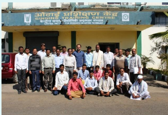
Group Photo: Farmers Training at GTC Nagpur

A five days farmers training course was conducted at Ginning Training Centre (GTC), Nagpur during 27 th to 31 st January, 2015. There were twenty three farmers from Jalna (MS), participated in the training program. Eminent speakers with expertise in cotton production and processing delivered the lectures. The training imparted theoretical and hands on training on proper cotton picking practices, importance of fibre quality parameters, by-product utilization, marketing, cotton processing and composting from cotton stalk etc.