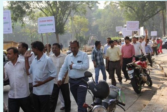
ICAR-CIRCOT Padyatra through Matunga, Mumbai

The staff of the Institute took out a padyatra from the institute through the Matunga area carrying with the banners and placards to create awareness in the citizens for a cleaner India. The institute staff members formed a human chain and removed the old files from the basement area of MS building for disposed on 27 th January, 2015.