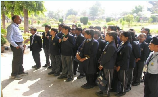
Students Visit at GTC Nagpur

Student's Visit at Coimbatore Regional Station Demonstration of HVI and AFIS for evaluation of major cotton fibre quality parameters were explained to 15 PhD students from Department of Plant Breeding and Genetics, TNAU, Coimbatore on 23 rd January, 2015.