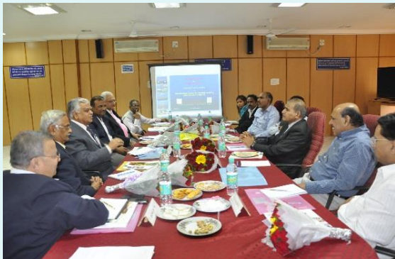
Advisory Committee Meeting for upgradation of GTC

The high level meeting was held at GTC, Nagpur during 12 th & 13 th January, 2015 to discuss regarding upgradation of the GTC to International centre catering to the research and training on ginning and biomass management.