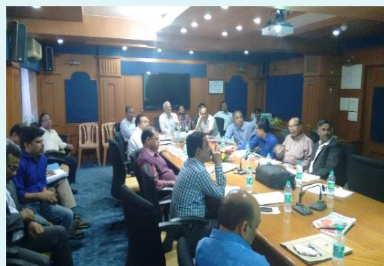
CRP on Natural fibres project meeting with all Principal Investigator's