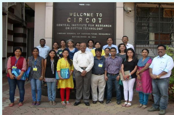
Group Photo: Training on Advances in Microscopy

A three day training programme on Advances in Microscopy was conducted from 19 th to 21 st January, 2015. This self-sponsored training programme was attended by ten participants from various states (Karnataka, Tamil Nadu, Himachal Pradesh, Assam and Maharashtra).