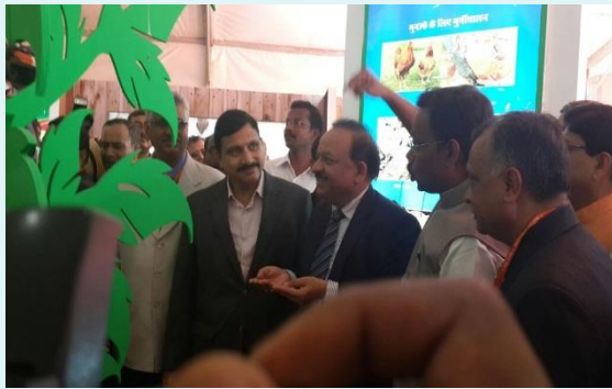
Shri Harshvardhan, Union Minister of Science and Technology at ICAR Exhibition Stall