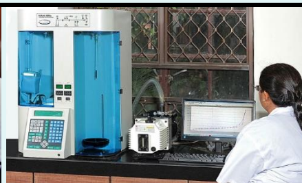
BET SURFACE AREA ANALYSER