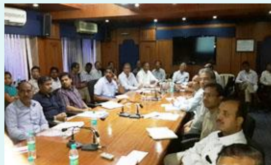
CRP on Natural fibres project meeting with CIRCOT scientist

be implemented by CIRCOT under CRP-Natural fibres. Based on the suggestions, Research projects are modified to achieve the desired results.