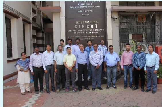
Group photo: Training on Cotton Spinning

A five day training programme on Cotton Spinning was organized at ICAR-CIRCOT, Mumbai from 5 th to 9 th January, 2015. The main objective of the programme was to update the knowledge and skills of trainee delegates in cotton spinning and cotton quality parameters, both in theory and practical mode and to keep abreast about the latest techniques and development in the spinning processes.