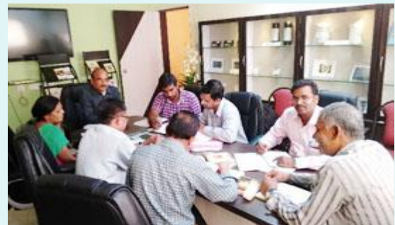
Hindi learning class

Under the Hindi Teaching Scheme, four staff members in Prabodh, nine in Praveen and one in Pragya are undergoing training at the Institute from January 15, 2015.