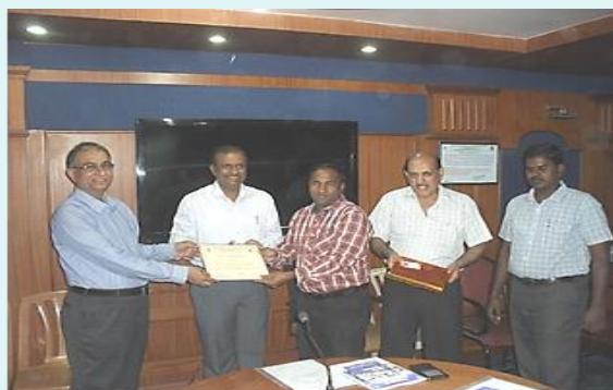
Valedictory Function of Training on Cotton Spinning