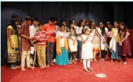
Children Performing Cultural programme