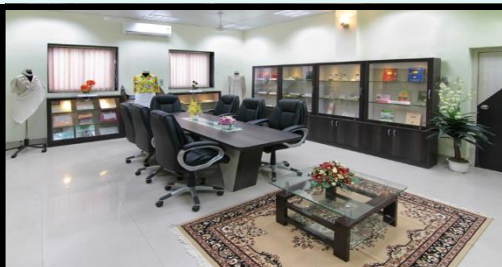
EXHIBITION CUM VISITORS' ROOM