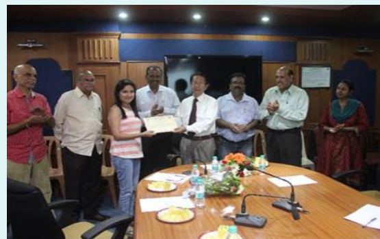
Valedictory function of Training on Advances in Microscopy

He emphasized the recent advances in analytical tool for pollutants identification much less than at the ppb level, high-resolution and high-speed camera, rapid detection of diseases by microscopy and the relevance of Moore's law in various technologies. He distributed certificates to the participants.