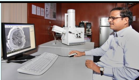
SCANNING ELECTRON MICROSCOPE