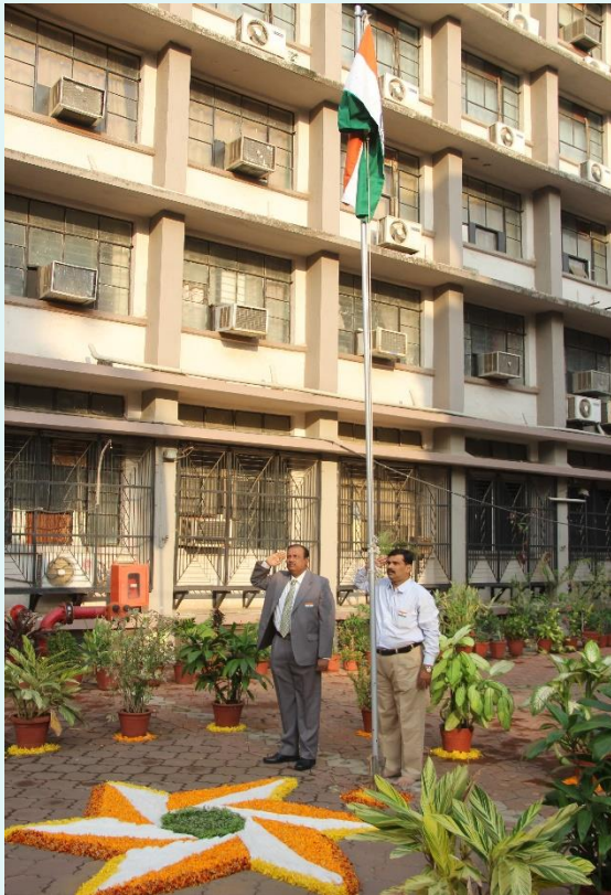
Hoisting of national flag by Director, CIRCOT