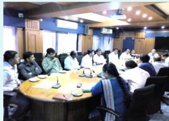
Inaugural function of training on Cotton Spinning

The training course imparted knowledge through lectures on the aspects of cotton quality evaluation, ginning, basics of spinning technology and machineries, new and advanced spinning systems, post spinning operations, cost and financial analysis of spinning industry. The course also covered practicals on fibre testing, micro and full spinning and new spinning techniques. A spinning mill visit was also arranged.