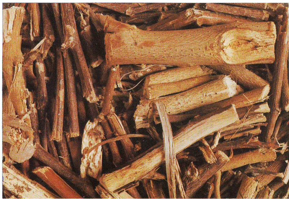
Chipped Cotton Plant Stalks

Corrugated boards of 3, 5 and 7 ply prepared from the kraft paper can be used for making boxes of various dimensions for packaging and transportation of fruits and vegetables.