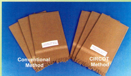
Towels processed in Mill