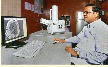
Scanning Electron Microscope (SEM)