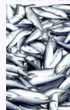
Fish & Poultry Feed