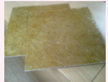
Natural Fibre Reinforced Composites