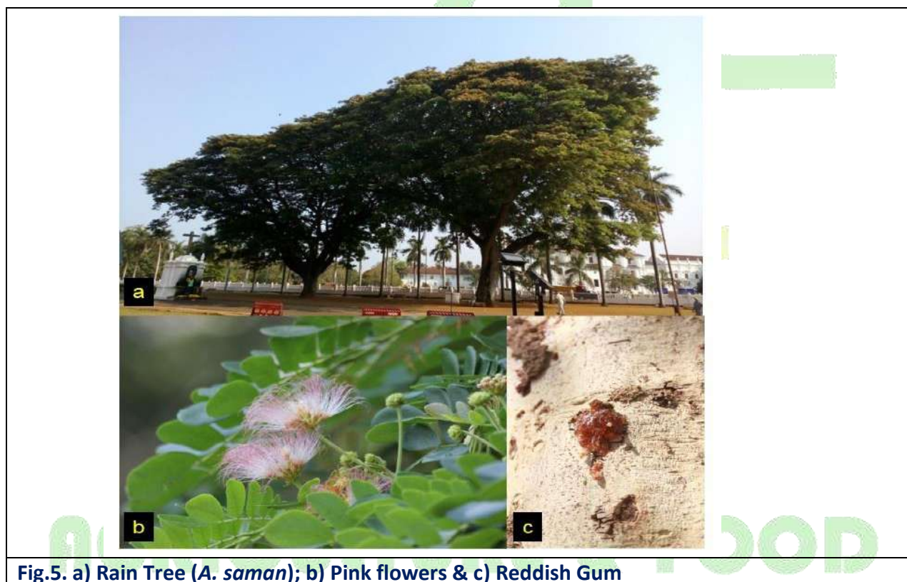
Fig.5. a) Rain Tree ( A. saman ); b) Pink flowers & c) Reddish Gum

Rain tree [ Albizia saman (Jacq.) Merr.] [Family: Fabaceae] is a natural host plant for lac insects ( Kerria spp.). It is an attractive, large-spreading deciduous tree. It has a low, dense, umbrella-shaped crown, feathery foliage, puffs of pink flowers with a short, usually crooked bole (Fig.5 a-c). Due to its rapid growth habit, it was spread to other parts of the world from Central America for railway fuel. The name rain tree has been attributed to many theories like closing of leaflets from dusk to dawn allowing rain to fall through the canopy to the ground below and a steady drizzle of honeydew from sap-sucking insects etc. (Staples and Elevitch 2006). Tree was introduced in India in 1880 principally as a shade or ornamental tree in streets, parks and in coffee plantations. It is a popular avenue tree and has many other uses like preparation of fruit drink from the pulp of pod, use of decoction of inner bark and fresh leaves to treat diarrhea, stomach-ache, skin problems, eczema and pruritus, fruit decoction as a sedative, seeds for treating a sore throat etc. The tree yields a gum of inferior quality which could be used as a poor man's substitute for gum Arabic and can be used as an adhesive.