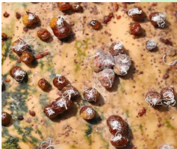
Fig.3. Female lac insect cell