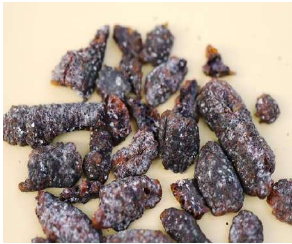
Fig.1. Lac resin