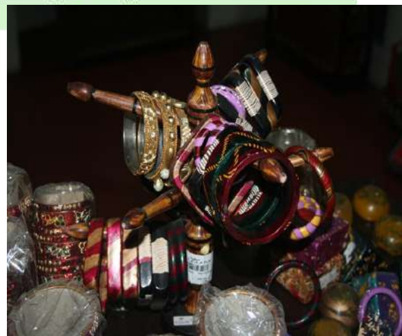
Fig. 4. Crafts prepared from lac resin