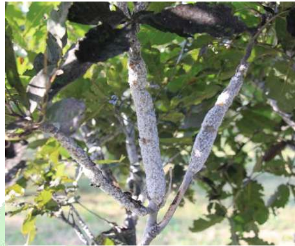
Fig.2. Lac insect encrustation