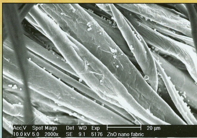
Efficient UV blocking and antibacterial activity

Nano-ZnO coated cotton fabrics showed efficient blockings of both UV-A (315 – 400 nm) and UV-B (280 – 315 nm) radiations.