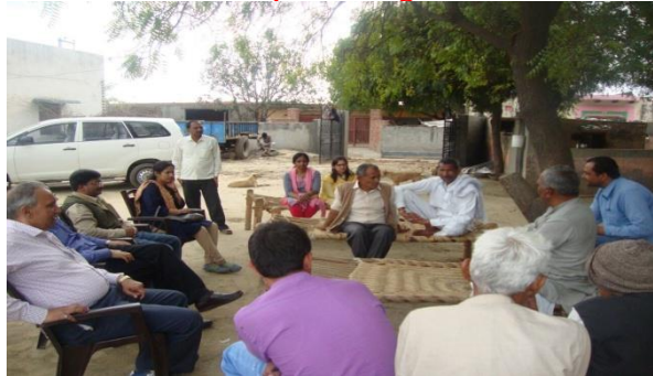
2. Scientists and farmers interaction at Narmohampur Viilage