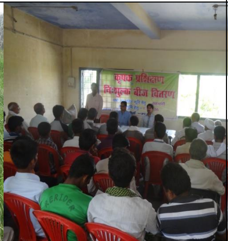
Farmer Train at District Mau, Uttar Pradesh