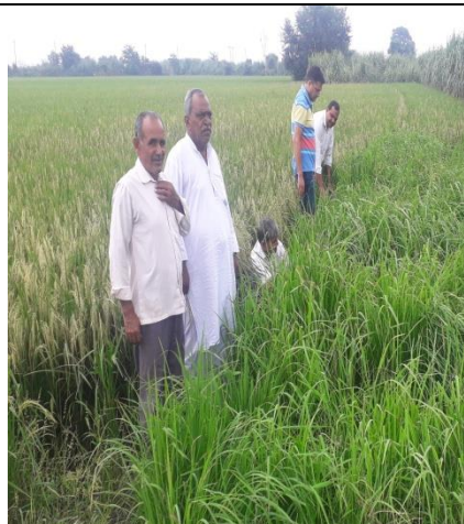
Field visit of Pusa Basmati 1637 at Normohandpur, Bulandshar village