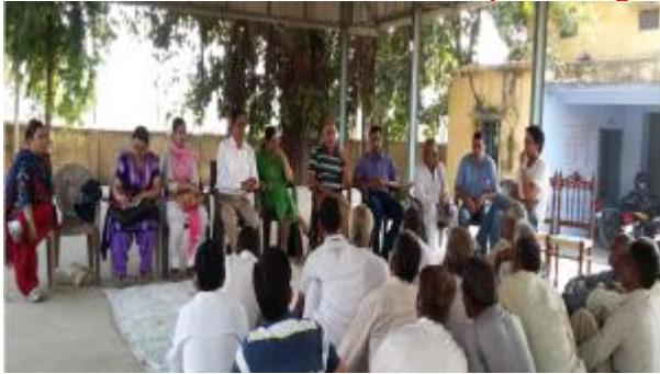
1. Project Director, ICAR-NIPB Interact with farmers at Narmohampur Viilage