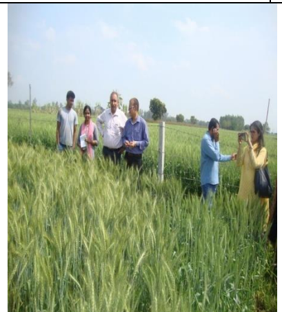
Field visit of wheat crop at Shriyal