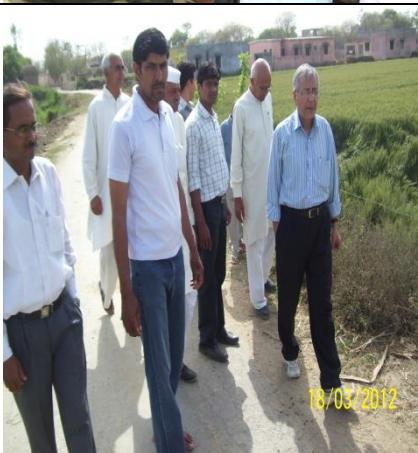
Field visit of wheat cropn at shaklapur