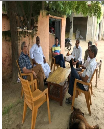
Group discussion with farmer at Normohandpur, Bulandshar village