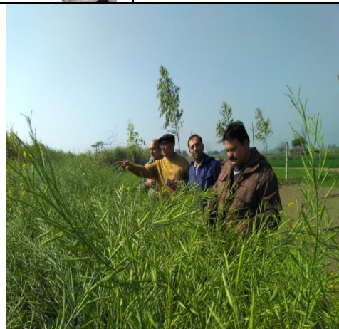
Field visit of pusa mustard varity pusa mustard 28 at Normohammadpur