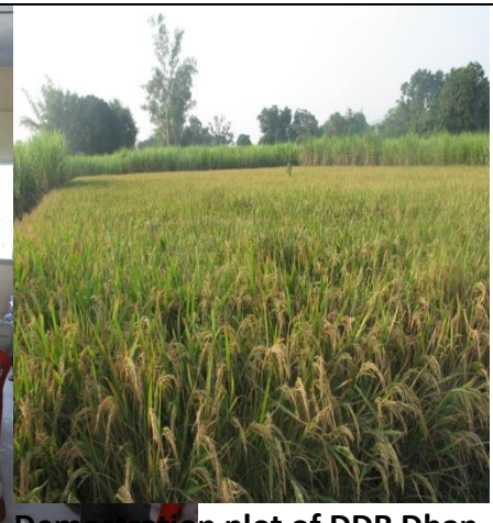
Demonstration plot of DDR Dhan 50 at Kushinagar, Uttar Pradesh