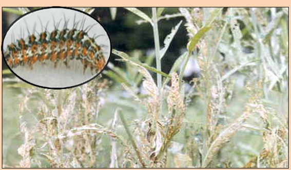
Crop affected by hairy caterpillar