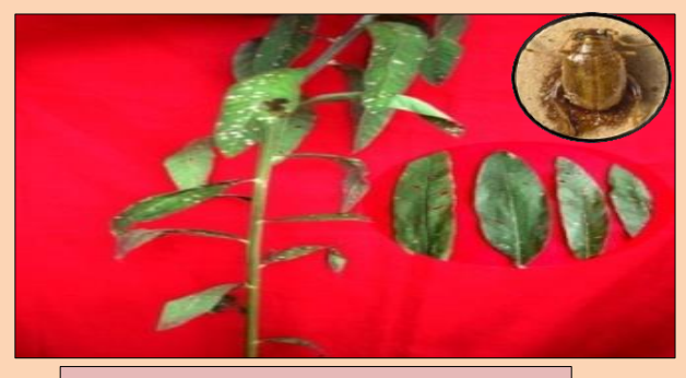
Flea beetle infested crop