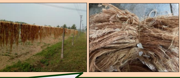
Drying of extracted fibre after extraction (ungummed)