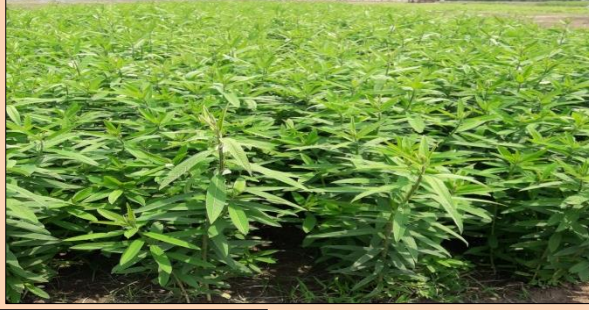
40 days old sunnhemp crop