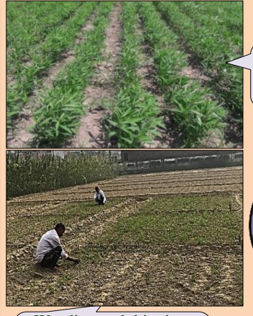
Weeding and thinning, protective spray with chlorpyriphos 20 EC @ 2ml/litre