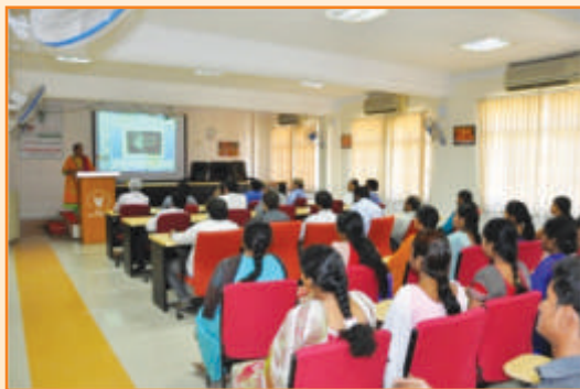
Staff of NRC on Meat participated in workshop