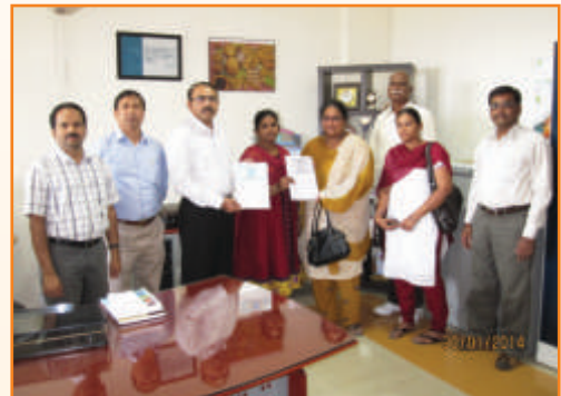
Meenakshi Foods, Hyderabad exchanging MoU document with Director, NRC on Meat