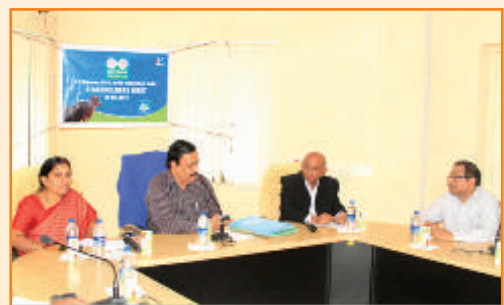
Stakeholders meeting of Sheep & Goat Expo-2014