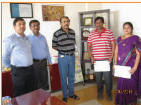
Veterinary doctors from export meat plant trained at NRC on Meat

Two veterinary doctors from Allanasons Exports, Hyderabad were trained at NRC on Meat from 4-8th February 2014 on "Meat Inspection and quality assurance".