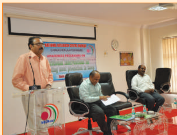
Director NRC on Meat addressing the participants

An awareness programme on "Nutritional interventions for augmenting meat production in sheep" was conducted on 4th June 2014 at National Research Centre on Meat, Hyderabad. A total of 35 participants comprising of farmers, entrepreneurs and officials of Government departments covering Adilabad, Nizamabad, Medak, Warangal, Nalgonda, Mahaboobnagar, Khammam, Hyderabad and Ranga Reddy districts of Telangana have participated in the programme.