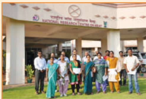
Women entrepreneurs trained at NRC on Meat

Two women from "Meenakshi Foods", Hyderabad and four women from "Hipro Fresh Chicken" Pune, Maharashtra have undergone three day hands-on training program from 11-13, February 2014 in "Value added meat products development for small and medium scale entrepreneurs".