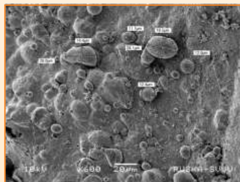
Scanning electron microscope of chicken emulsion incorporated with modified soy protein