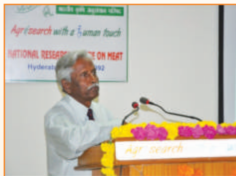
Dr.M. Vijay Gupta, World Food Prize laureate-2005 delivering a foundation day lecture