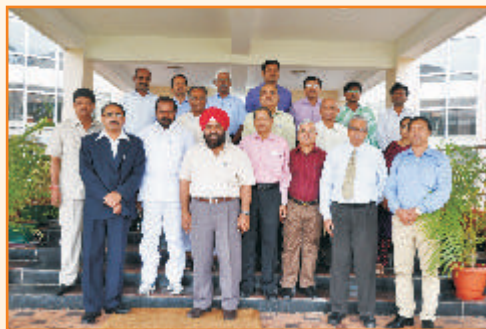
Chairman and members of RAC committee with NRC on Meat scientists