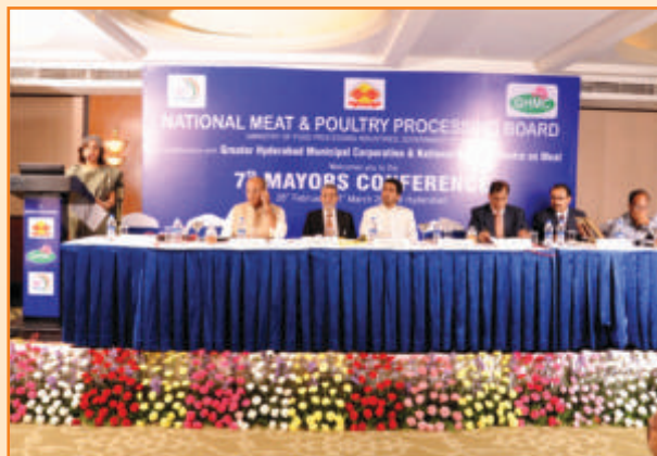
Inaugural session of 7th Mayors conference