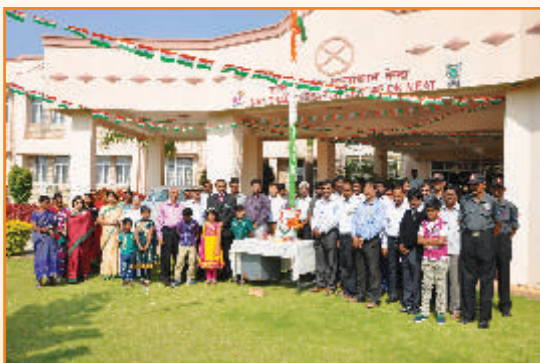
Republic day celebration at NRC on Meat

Director NRC on Meat unfurled the National flag on the eve of 65th Republic day at NRC on Meat, Hyderabad in the forenoon of 26th January, 2014. Staff of NRC Meat and their family members have participated in the celebration.