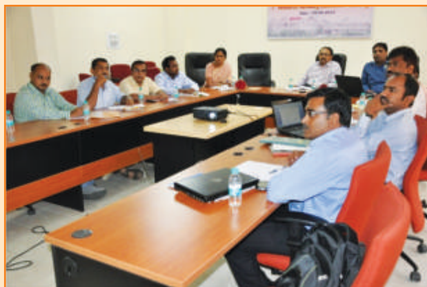
Participants of review meeting