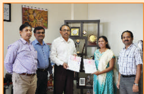
Hipro Foods, Pune exchanging MoU document with Director, NRC on Meat