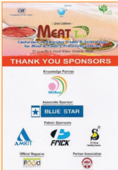
Sponsors of Meat Tech-2014

National Research Centre on Meat, Hyderabad collaborated with Tamil Nadu Technology Development and Promotion Centre (TNDPC) of Confederation of Indian Industry (CII) as knowledge partner for organizing Meat Tech-2014 at Hotel Hilton, Chennai on 27th June, 2014. The event was attended by several meat processors, entrepreneurs, industrialists, academicians, students, equipment manufacturers and suppliers etc.