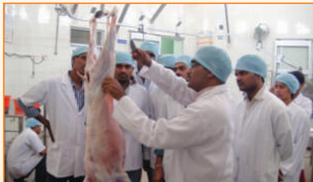
Practical demonstration on meat inspection and hygienic meat production

Seven veterinary doctors from Department of Animal Husbandry, Government of Andhra Pradesh have undergone 3 days training program on "Management of Modern abattoir" from 19-21 May, 2014 at NRC on Meat.