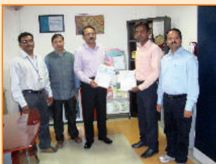
Representative from SEANA exchanging MoU document with Director, NRC on Meat