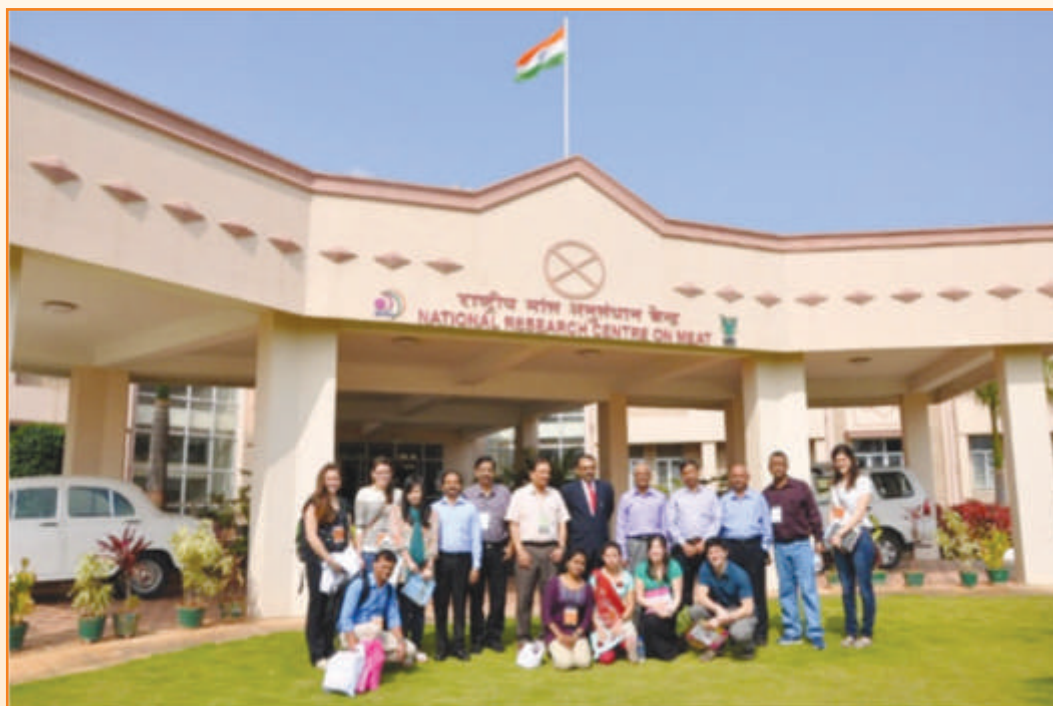
Students and faculty members from Cornell University, USA visited NRC on Meat