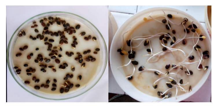
Figure 4 Germination of Albizia procera seeds in petri dishes