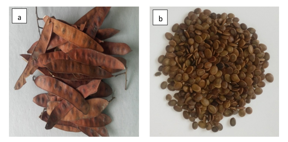
Figure 3 Pods (a) and extracted seeds (b) of Albizia procera collected from different provenances of Uttrakhand

Extracted seeds were again sun dried to reduce moisture. Discolored, stained and damaged seeds were removed and the remaining healthy seeds were used for further experiments.