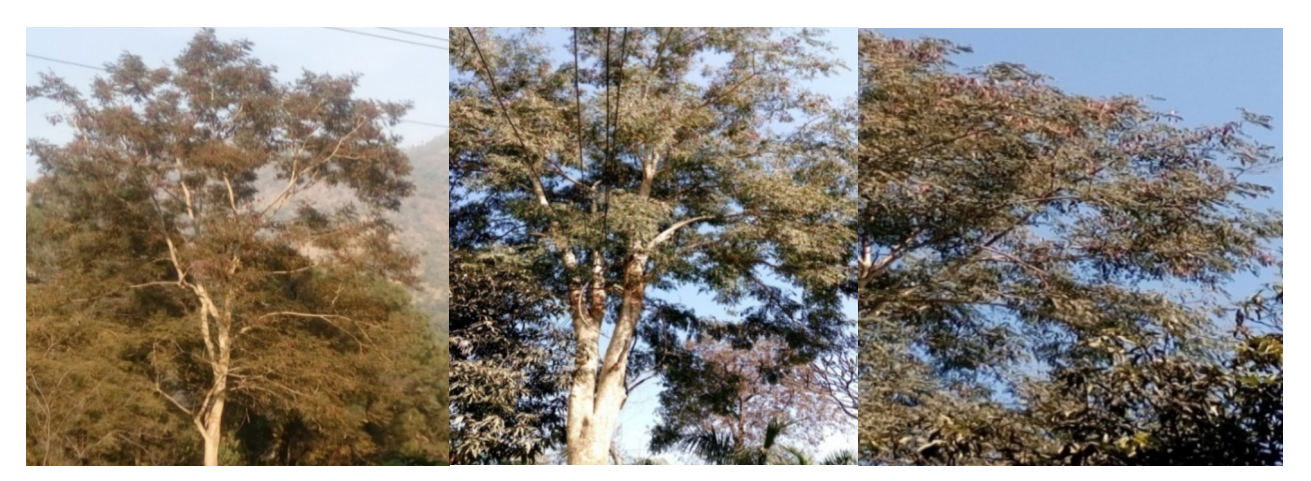
Figure 1 Natural population distribution of Albizia procera in Uttrakhand