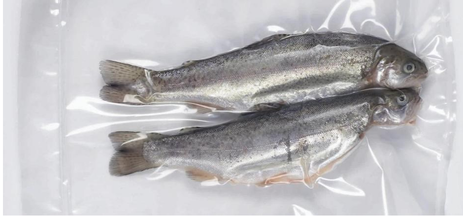
Fig 1. Vacuum packaging machine and Vacuum packed fish