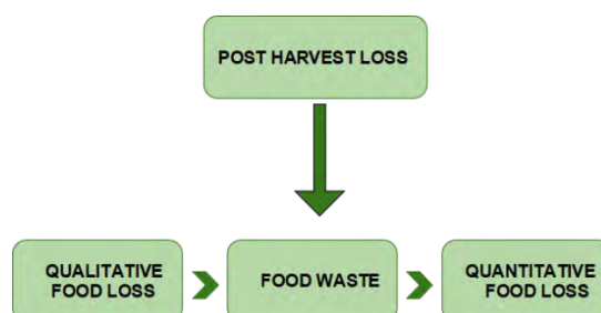
Fig. 1 Components of post-harvest loss

Loss is defined as a reduction in the weight of edible products available for consumption. It is a measurable reduction in foodstuffs and may affect either quantity or quality" (Tyler and Gilman, 1979). The major proportion of loss is due to quality and economic losses than quantitative losses. Post-harvest fish losses are often caused by biochemical and microbiological spoilage changes that occur in fish after death. PHL refers to measurable quantitative and qualitative food loss in the post-harvest system. It is defined as the loss from various stages of harvesting to the stage of consumption resulting from qualitative loss, quantitative loss and the food waste. FAO has estimated that post-harvest losses in developing countries vary up to 50% of domestic fish production. Globally, 35% of fish and seafood losses occurred every year which includes 8% of fish harvested being thrown back into the sea.