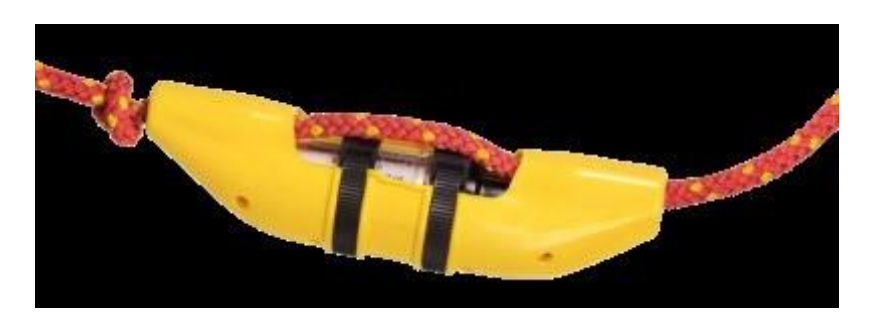
Fig. 2. A typical banana pinger used in gill nets and seine nets

suitable and efficient mechanism to distract cetaceans from the fishing gears (Fig. 3). Pingers sometime referred as net alarms is one of the best options to reduce injury and resulted mortality of marine mammals. Dolphin pingers are the devices that produces ultrasound which alert and keep the dolphins and porpoises away from the nets. Pinger is designed to work by emitting a sound wave signal beyond 70 kHz that is known to be in the best hearing range of most dolphin species. The signal acts as an alarm and in some cases the pinger stimulates dolphins to use their echolocation which alerts them to the presence of the pingers and fishing nets. This sound wave is not audible to human beings, but it creates disturbance to dolphins and alert dolphins the presence of nets. Pingers are efficient to minimize cetacean interaction both in gillnets and seine nets.