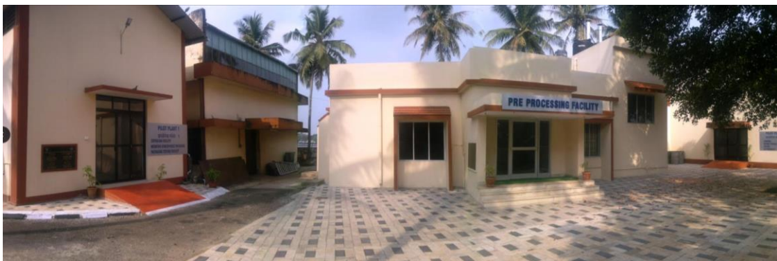
Plant Plant Facility