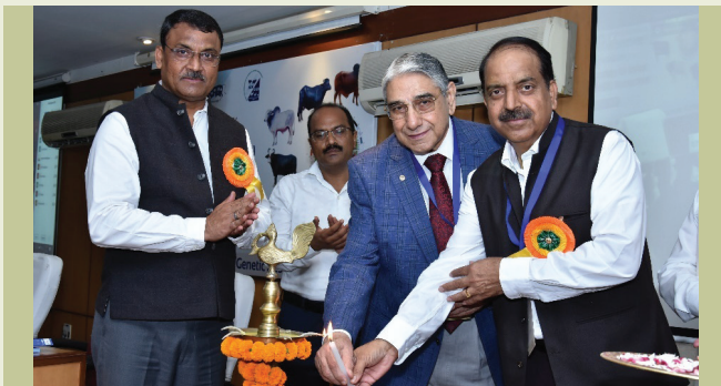
Inauguration of SOCDAB National Symposium 2022