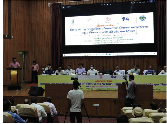
Interface Meet on Mission Zero Non-descript AnGR at Patna, Bihar