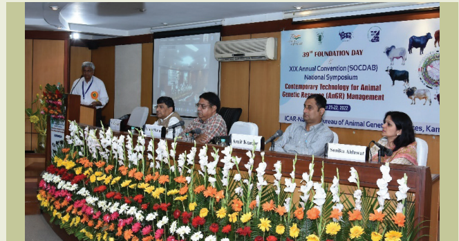
Lead lecture presentation in a Technical Session