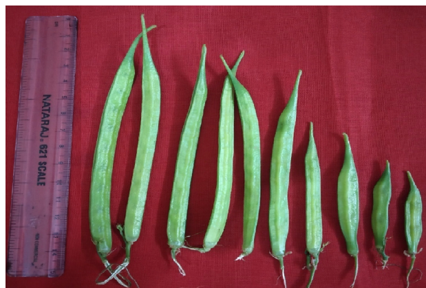
Fig. 4: Variation in pod length obtained through mutation in M_2 generation