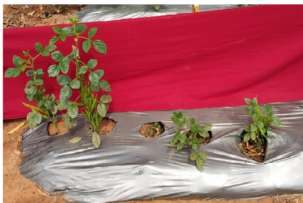
Fig. 3: Variation in plant height obtained in M_2 generation (dwarf mutants)

Whereas, traits like number of clusters per plant, number of pods per plant, ten pod weight and yield per plant revealed non-significant differences among mutants indicating selection for this trait from the mutant population will be ineffective because of predominance of environmental effect. For days to 50 per cent flowering, variation was found significant between mutants but non-significant over checks that means mutants are on par with the checks or they are of late maturing types which is not the objective of the present study. The variation created through mutation for pod length (Fig. 4) was found significant between the mutants and also over checks. It showed low GCV and PCV but high heritability coupled with moderate genetic advance. Selection would be effective for this trait because of higher heritability and moderate genetic advance due to additive gene