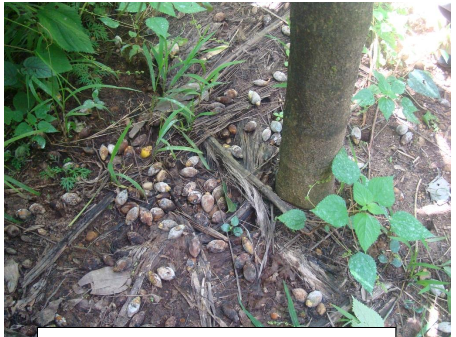
Fallen nuts due to koleroga