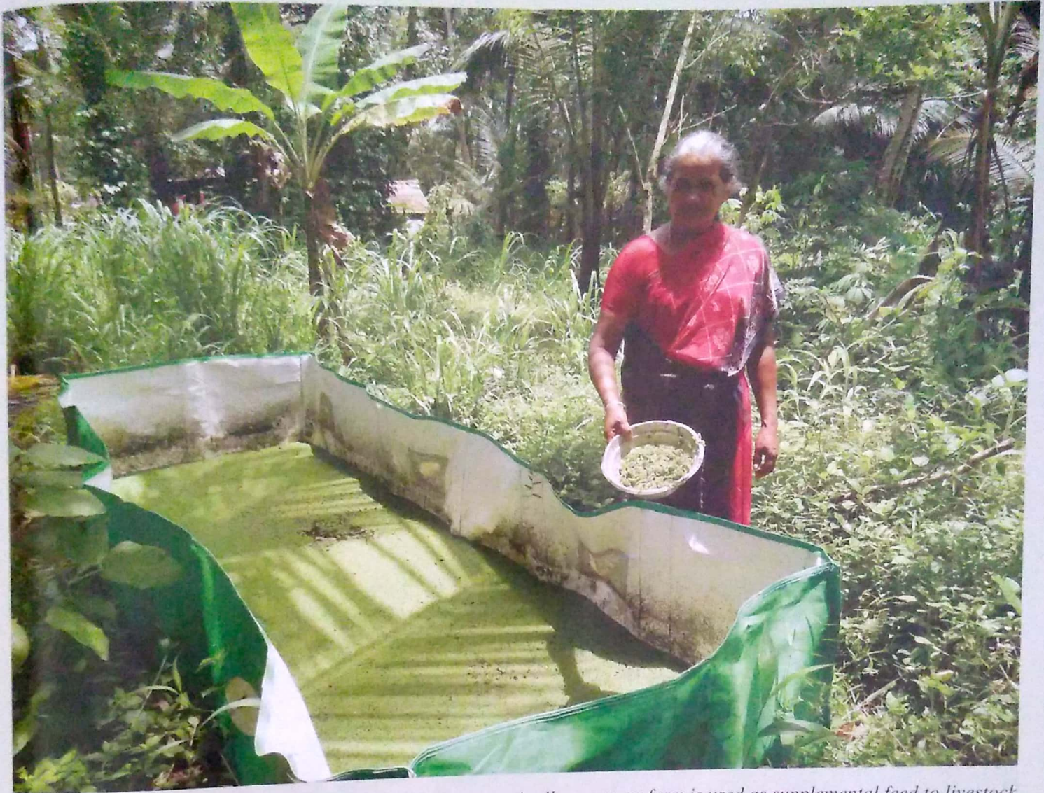
Azolla grown on farm is used as supplemental feed to livestock