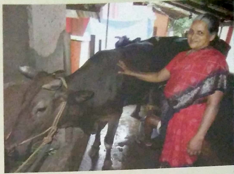
Returns from livestock adds to the family income

Indian Council of Agricultural Research- Central Plantation Crops Research Institute (ICAR-CPCRI) has been implementing several outreach and participatory extension research programme among farming community. Under its 'Farmers FIRST' programme