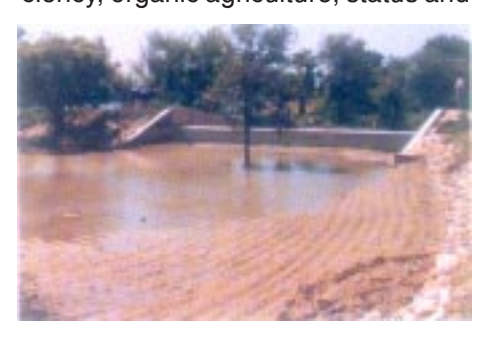
Concerted efforts have been made by the Centre to study total factor productivity in the Indo-Gangetic states

Keeping in view the mounting stress and strain on natural resources, NCAP strongly feels that the social science group within NARS must address the economic and social dimensions of health of our natural resources, causes of their degradation and technological and policy options available to counter these. The major research efforts of the Centre under this theme include: study of total factor productivity in the Indo-Gangetic states, input use efficiency, organic agriculture, status and