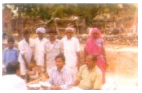
Business and scientific opportunities have encouraged research partnerships and institutional innovations

The paradigms which governed institutional development and agricultural transformation have undergone a sea change in recent years. Serious empirical studies on this paradigm shift are needed. For instance, during the last two decades or so, there is increasing participation of private seed companies in the Indian Seed Sector. This trend was largely influenced by enactment of the new Seed Policy in 1988 and policy of open access to the public germplasm, varieties and hybrids. Keeping these major institutional changes in view, the Centre has taken up and completed some seed industry studies. They have shown that enabling policy environment and business and scientific opportunities have encouraged research partnerships and institutional innovations. There is increasing participation of the private sector in the development, multiplication and distribution of improved seeds. There is increased access of farmers to quality seed. There is however imperfection in the commercial seed market. The private sector has no incentive to promote new varieties of self-pollinated crops and there is little