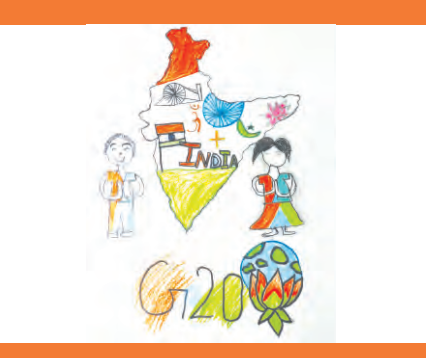
Thaksika K, VI std