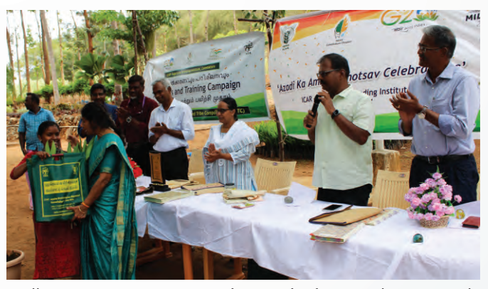
Talk on 'Getting organic certification for farm produce' at Agali Participation in International / National Workshop / Seminar / Meeting / Symposium