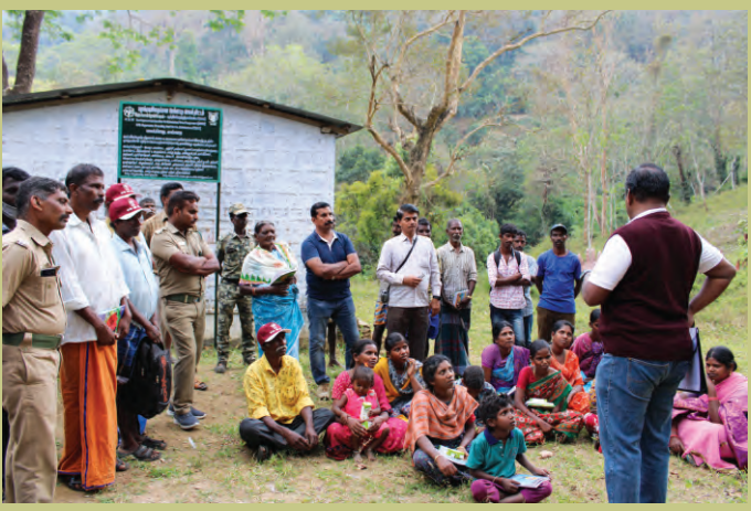
The STC team did a 3-hour trek through dense forests to reach Paalakinaru a remote tribal settlement in the Anamalai Tiger Reserve