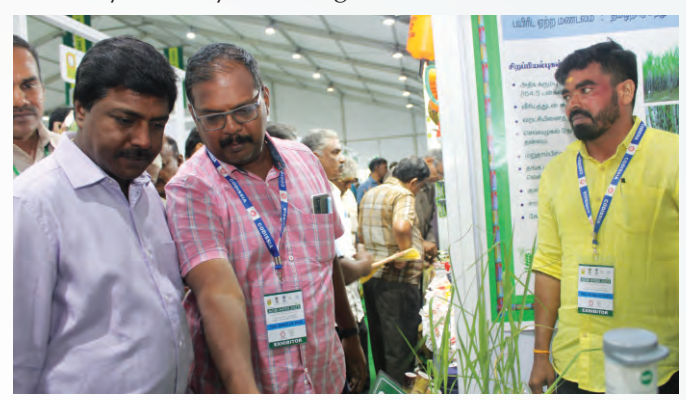
Registrar of Tamil Nadu Agricultural University at ICAR-SBI's stall

F Participated in "Velaan Sangamam 2023" - State -level Agricultural Exhibition – 2023 organized by Department of Agriculture, Govt. of Tamil Nadu during 26-28<sup>th</sup> July, 2023 at CARE college of Engineering, Tiruchirapalli.