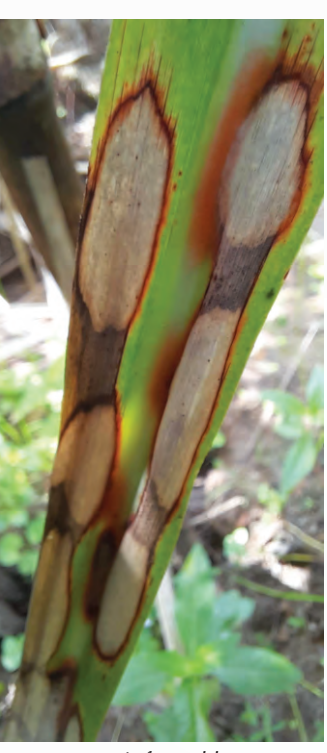
Disease affected plants (a), symptoms on infected leaves (b), sclerotial bodies on infected leaf

ugarcane suffers from many diseases such as red rot, wilt and smut, rust, leaf scald, grassy shoot,