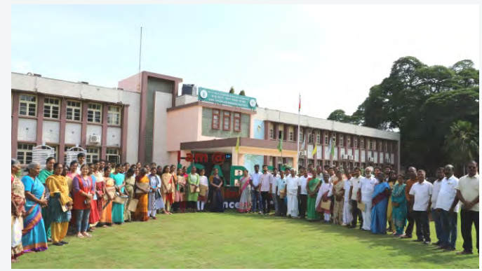
PPV&FRA act programme at ICAR-SBI

F A one-day training programme on "Seed health improvement: A success key for healthy crop, better recovery and profitable sugarcane farming" was organized for the farmers and sugar mill officials from Bihar, Haryana, Punjab, Uttarakhand and Uttar Pradesh on August 08, 2023 at ICAR-SBIRC, Karnal