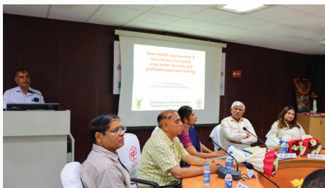
Seed health training programme at Karnal

F A one-day training programme on "Seed health improvement: A success key for healthy crop, better recovery and profitable sugarcane farming" was organized for the farmers and sugar mill officials from Bihar, Haryana, Punjab, Uttarakhand and Uttar Pradesh on August 08, 2023 at ICAR-SBIRC, Karnal