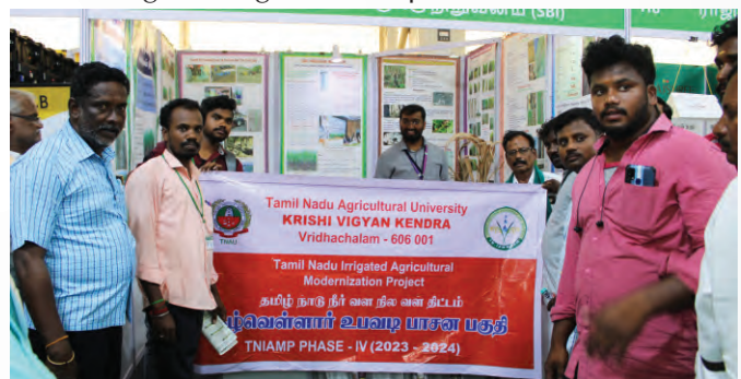
ICAR-SBI stall at State-level Agricultural Exhibition of TamilNadu

F Participated in "Velaan Sangamam 2023" - State -level Agricultural Exhibition – 2023 organized by Department of Agriculture, Govt. of Tamil Nadu during 26-28<sup>th</sup> July, 2023 at CARE college of Engineering, Tiruchirapalli.